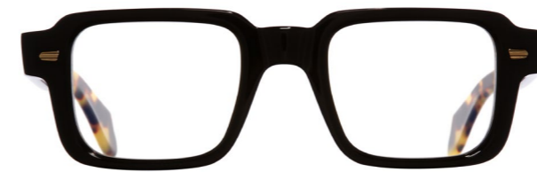
CGOP-1393-50-01 Black on Camo

Adopted as an urban fashion icon in the 60s and early 70s, the military 'GI' frame was utilitarian and well constructed, often sun lenses were added by the new wearer for customisation. Owing to its soldierly roots, the 1393 is the perfect square, with lowered hinges, enabling a helmet to be worn, and a pronounced nose-bump increasing ventilation and reducing fogging. Interior milling allows the frames to be worn all day due to the added comfort and balance afforded by the extra internal hand-finishing process.