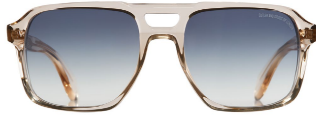
CGSN-1394-57-04 Granny Chic