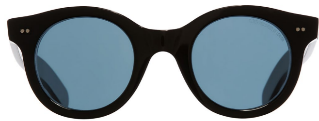
CGSN-1390-47-01 Black on Blue

The 1390 is a welcome reincarnation of the 0197 and 0737, revitalised using traditional handmade artisans combined with state-of-the-art hardware and raw materials, every step taking place at our dedicated atelier adding gravitas and durability. Understated yet powerful, this frame symbolises the newfound confidence and soul of the 1980s. A round oval, the shape universally lends itself to all personalities and face shapes.