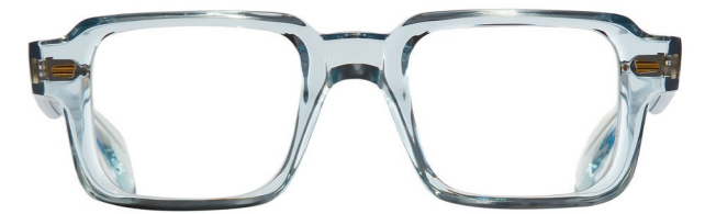
CGOP-1393-50-04 Homesick Blues