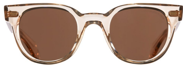
CGSN-1392-49-03 Granny Chic