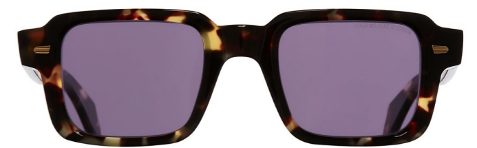
CGSN-1393-50-02 Urban Camo