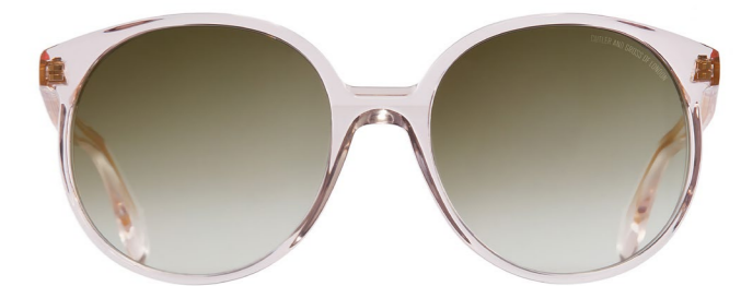
CGSN-1395-57-04 Persian Pink