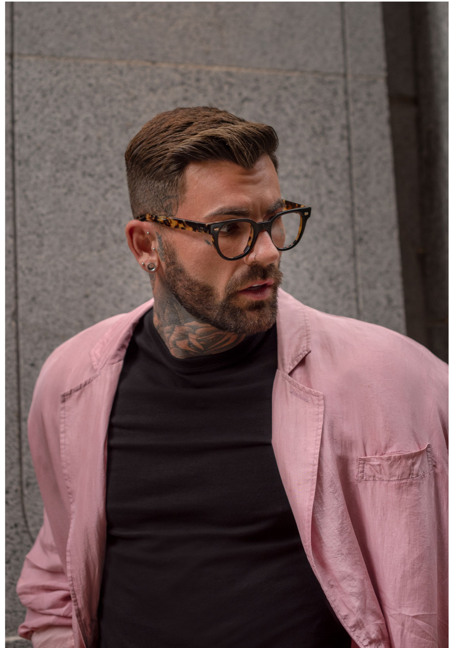
Model wears CGOP-1392-49-01 in Black on Camo