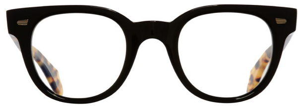
CGOP-1392-49-01 Black on Camo

The 1392 is inspired by the uniform of the Beatniks, which included thick rimmed glasses, cigarette pants and roll neck sweaters. A squared round with perfect proportions; understated, yet immaculately formed resulting in a truly unisex style. Featuring a relaxed fit bridge and comfort milled interior, which favours both form and function.