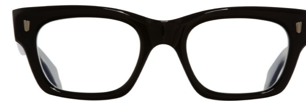
CGOP-1391-53-01 Black on Blue

Paying further homage to its musical inspiration, the new temple core takes on the guise of a guitar fretboard and one of the custom acetate colourways resembles broken vinyl records.