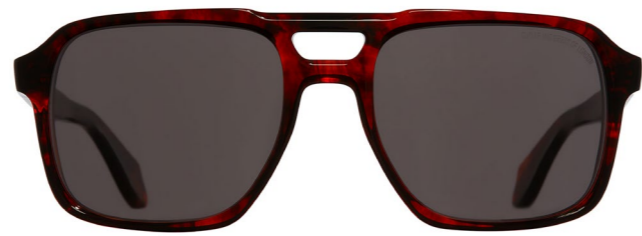
CGSN-1394-57-02 Nolita Havana