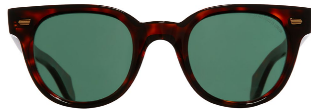
CGSN-1392-49-02 Dark Turtle