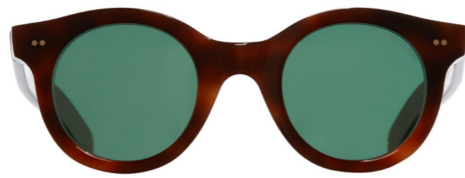
CGSN-1390-47-02 Vintage Sunburst