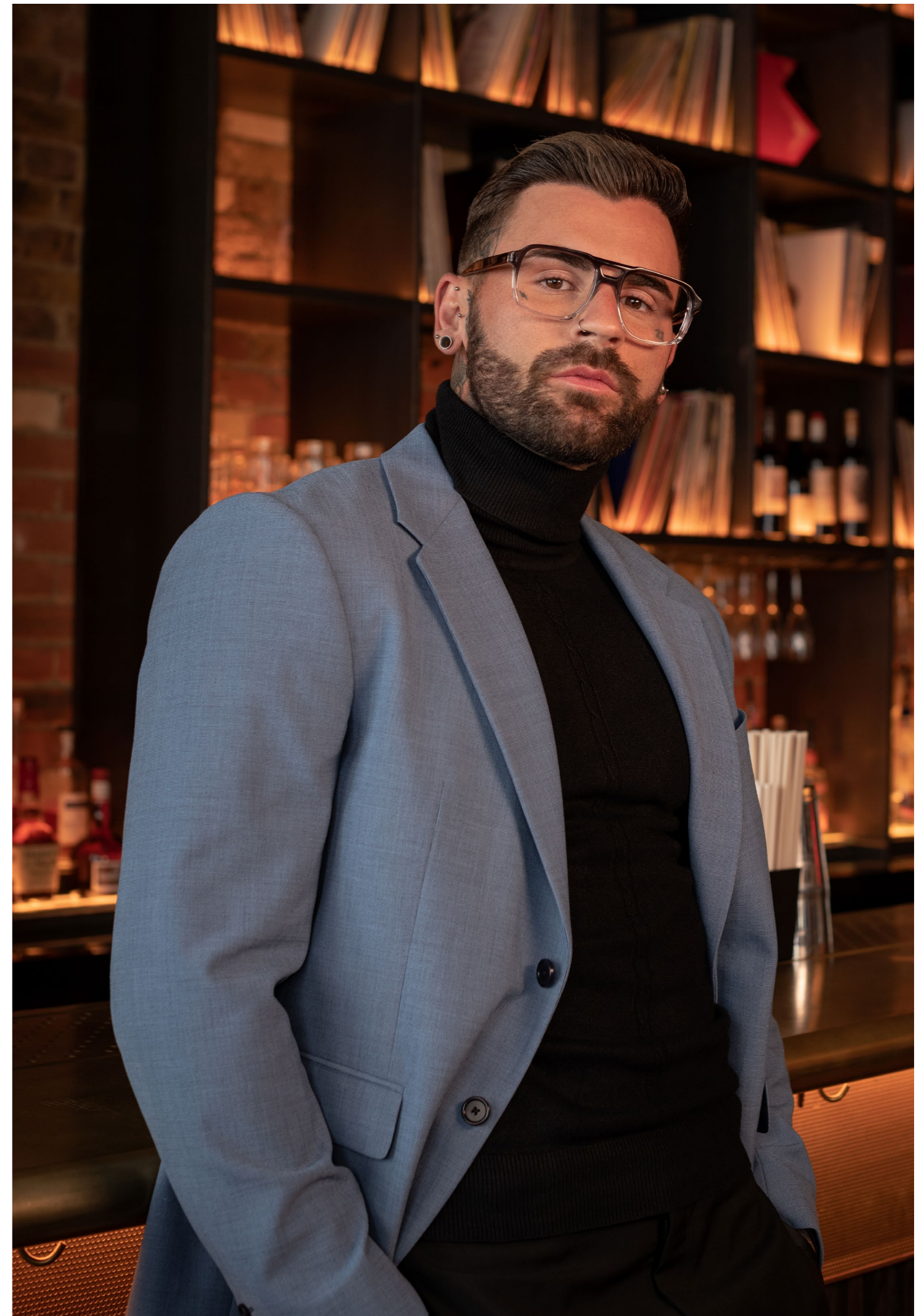
Model wears CGOP-1394-57-04 in Black Beauty