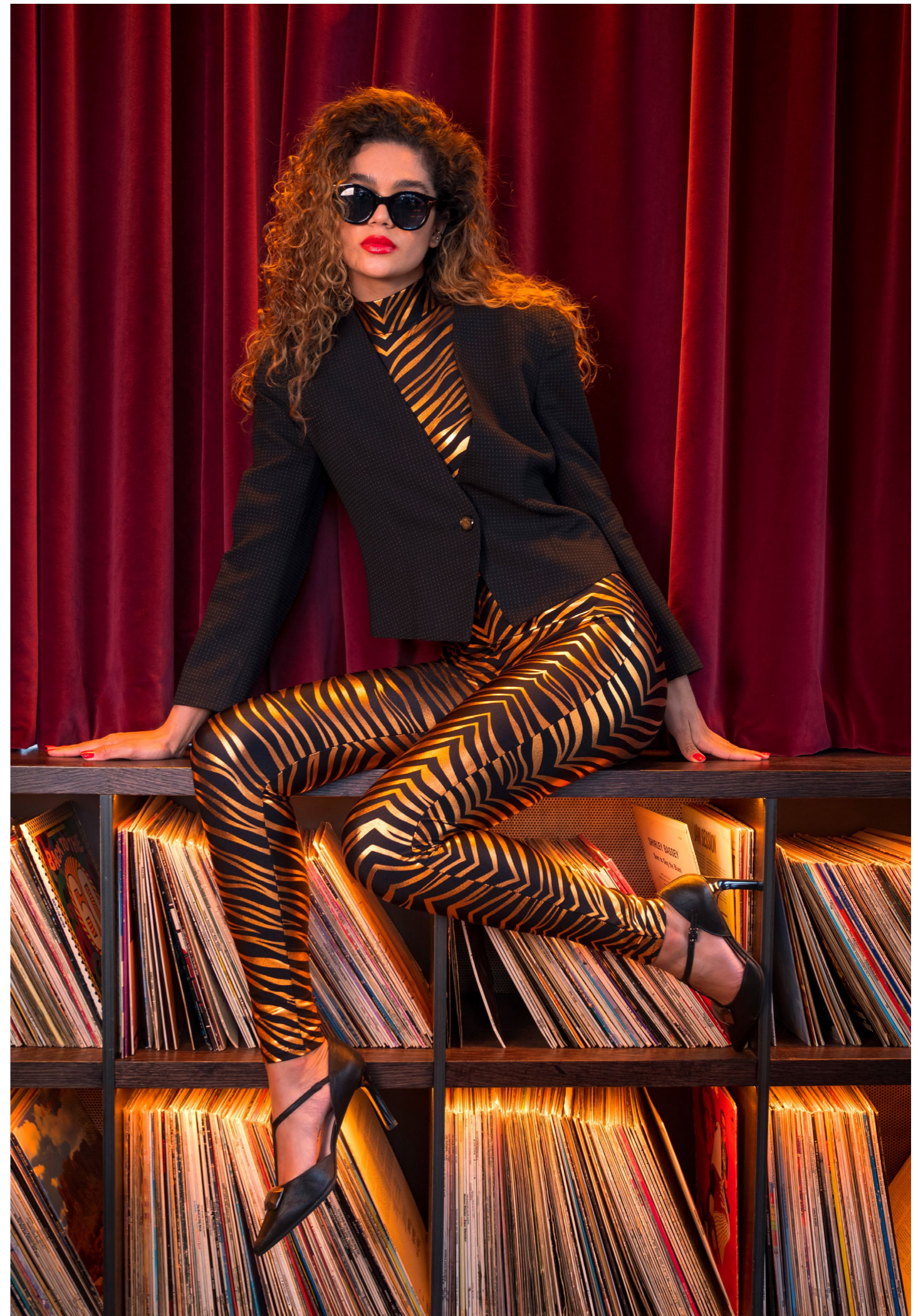
Model wears CGSN-1390-47-01 in Black on Blue