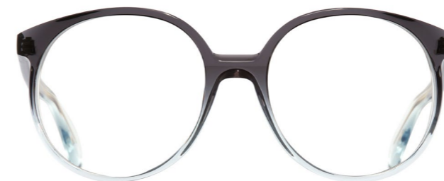
CGOP-1395-57-03 Black Beauty