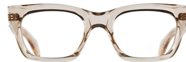
CGOP-1391-53-03 Granny Chic