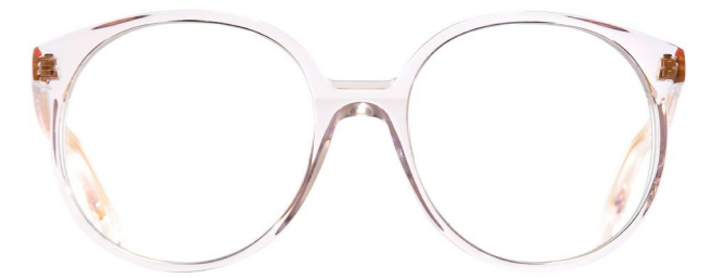
CGOP-1395-57-04 Persian Pink