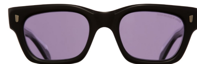
CGSN-1391-53-05 Matte Black