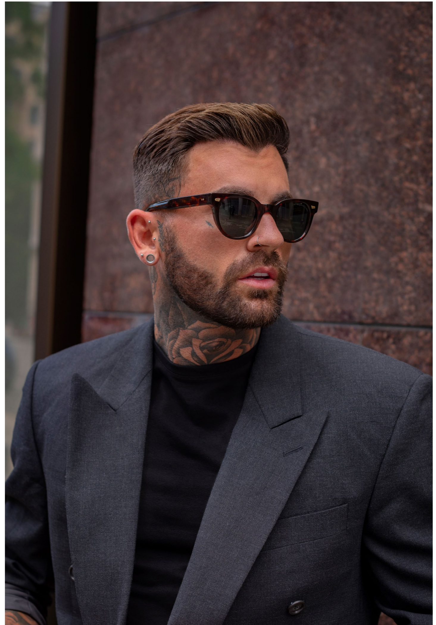
Model wears CGSN-1392-49-02 in Dark Turtle