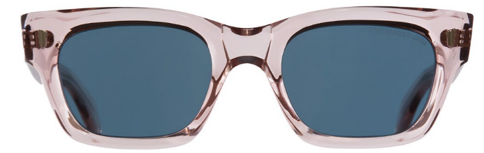
CGSN-1391-53-04 Big Pink