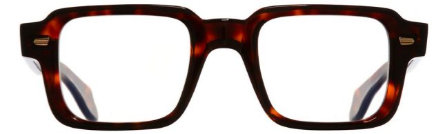
CGOP-1393-50-02 Dark Turtle