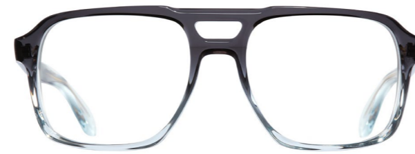
CGOP-1394-57-04 Black Beauty