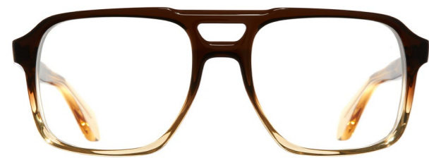
CGOP-1394-57-03 Honeyburst Fade