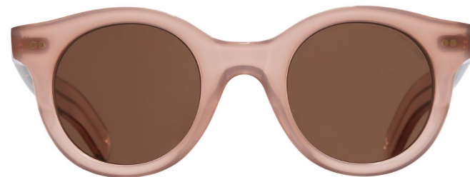
CGSN-1390-47-03 Papa Don't Peach