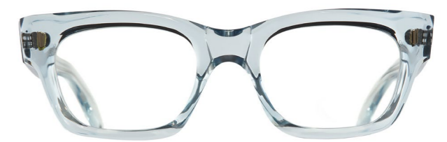
CGOP-1391-53-04 Homesick Blues