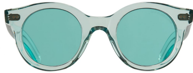
CGSN-1390-47-04 Isla Bonita Blue