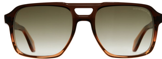
CGSN-1394-57-03 Fireburst Grad