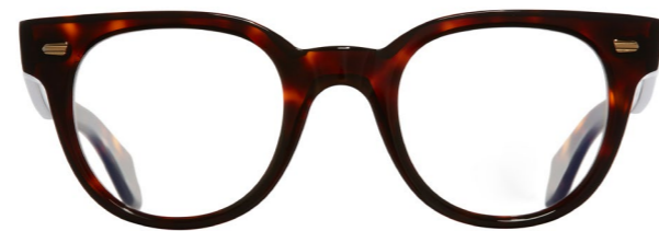
CGOP-1392-49-02 Dark Turtle