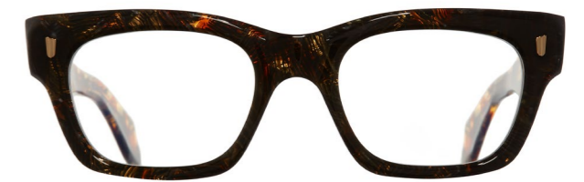
CGOP-1391-53-02 Brush Stroke