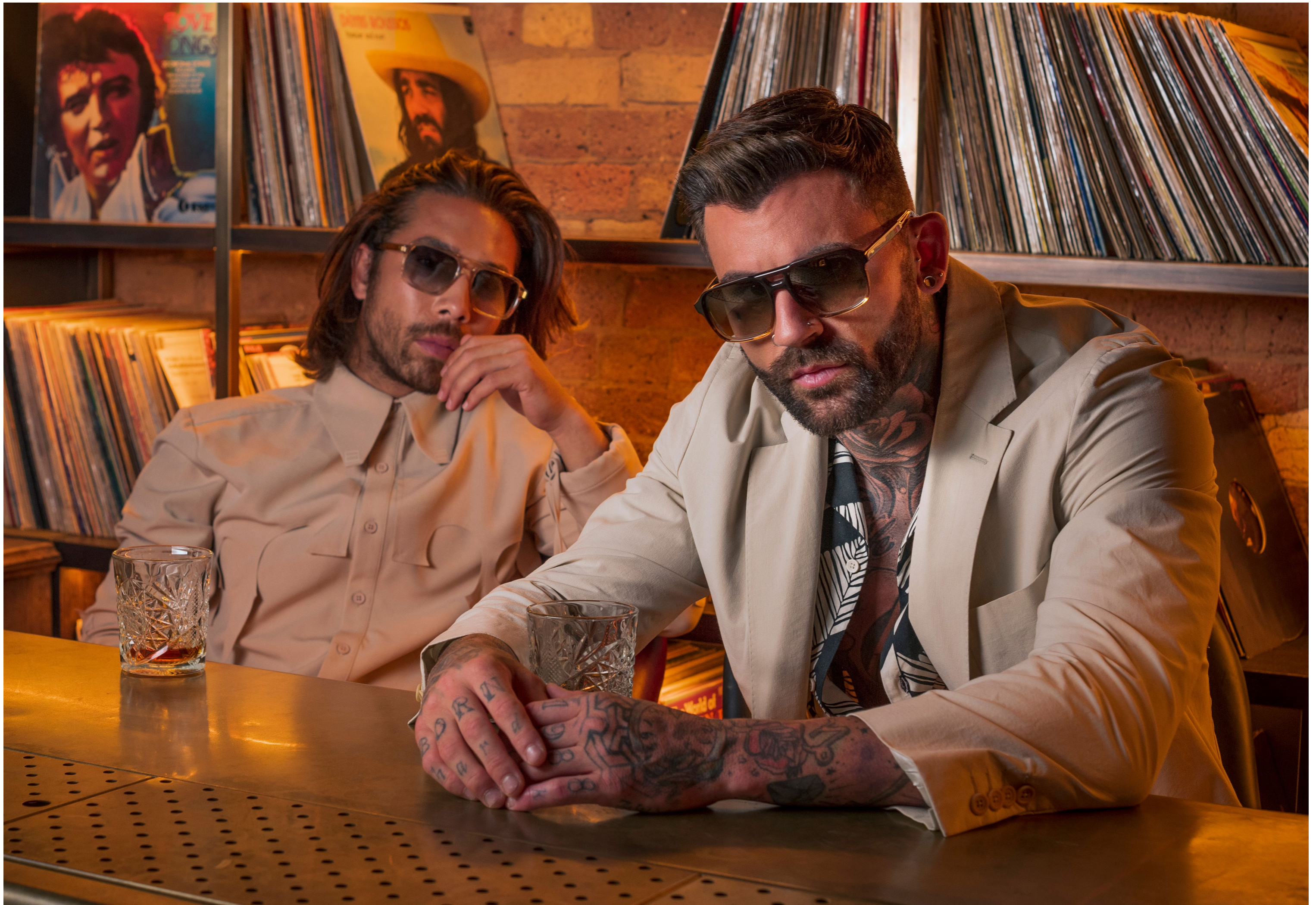
Models wear CGSN-1394-57-04 in Granny Chic and CGSN-1394-57-03 in Fireburst Grad