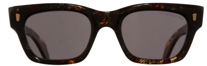
CGSN-1391-53-02 Brush Stroke