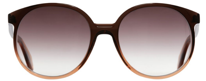
CGSN-1395-57-02 Fireburst Grad