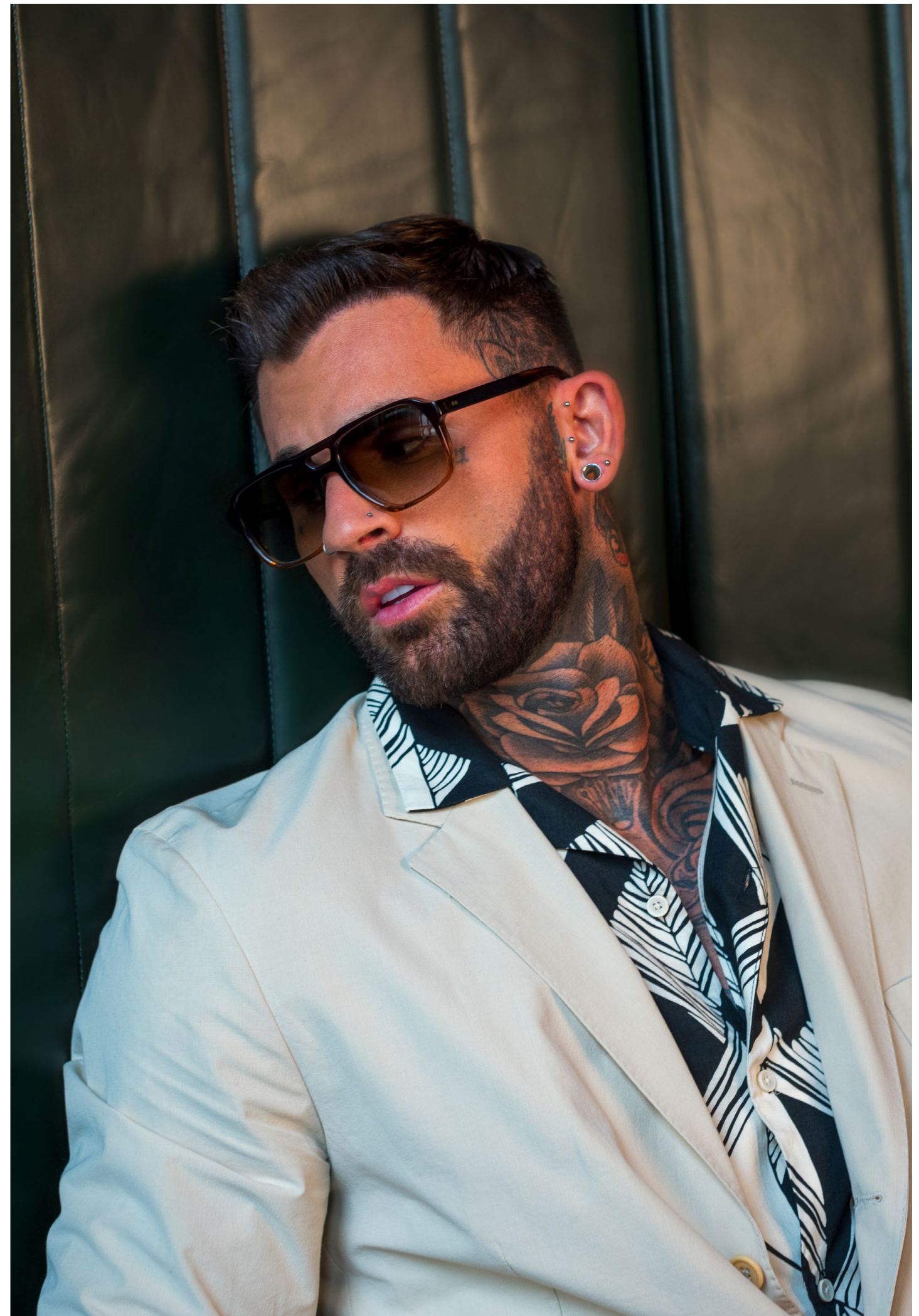
Model wears CGSN-1394-57-03 in Fireburst Grad