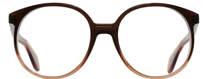
CGOP-1395-57-02 Fireburst Grad