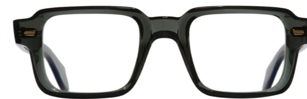
CGOP-1393-50-03 Aviator Blue