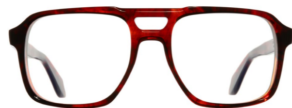
CGOP-1394-57-02 Nolita Havana