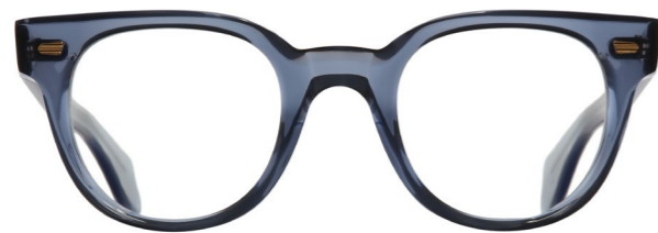
CGOP-1392-49-03 Brooklyn Blue