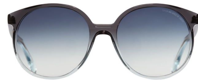
CGSN-1395-57-03 Black Beauty