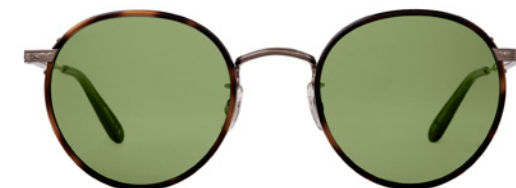
SPOTTED BROWN SHELL-COPPER 4003-49-SPBRNSH-CO/SFPGN