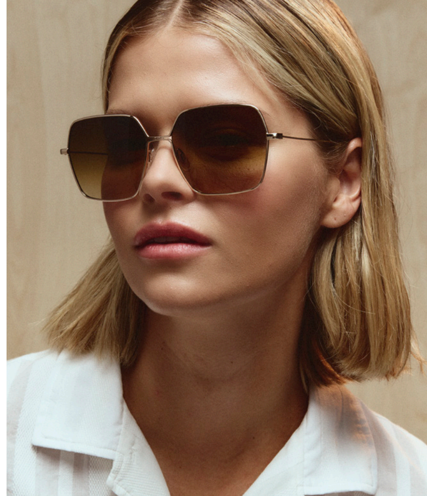
THE MEADOW / In Antique Gold Burnt Tortoise with Brunette Gradient