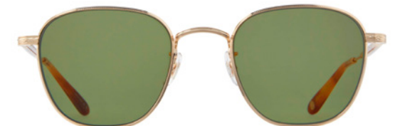
GOLD-EMBER TORTOISE 4052-49-G-EMT/SFGRN