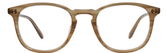
PALISADE TORTOISE 1007-47-PAT / 1007-49-PAT