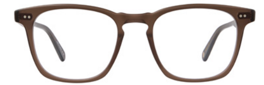
MATTE ESPRESSO 1150-50-MESP