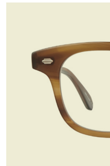
Optical - True Demi

Three ways to wear the versatile Sherwood. This one feels like a future classic.