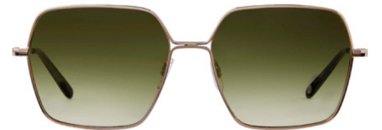
GOLD-DOUGLAS FIR 4067-56-G-DGFR/OG