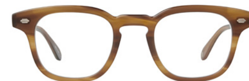
TRUE DEMI 1154-44-TD / 1154-47-TD