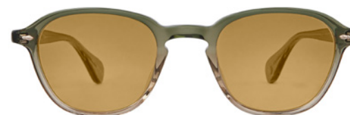
CYPRUS FADE 2121-46-CYPF/PMP