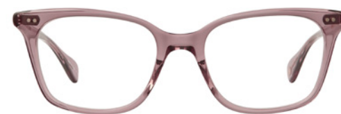
DESERT ROSE 1155-49-DER