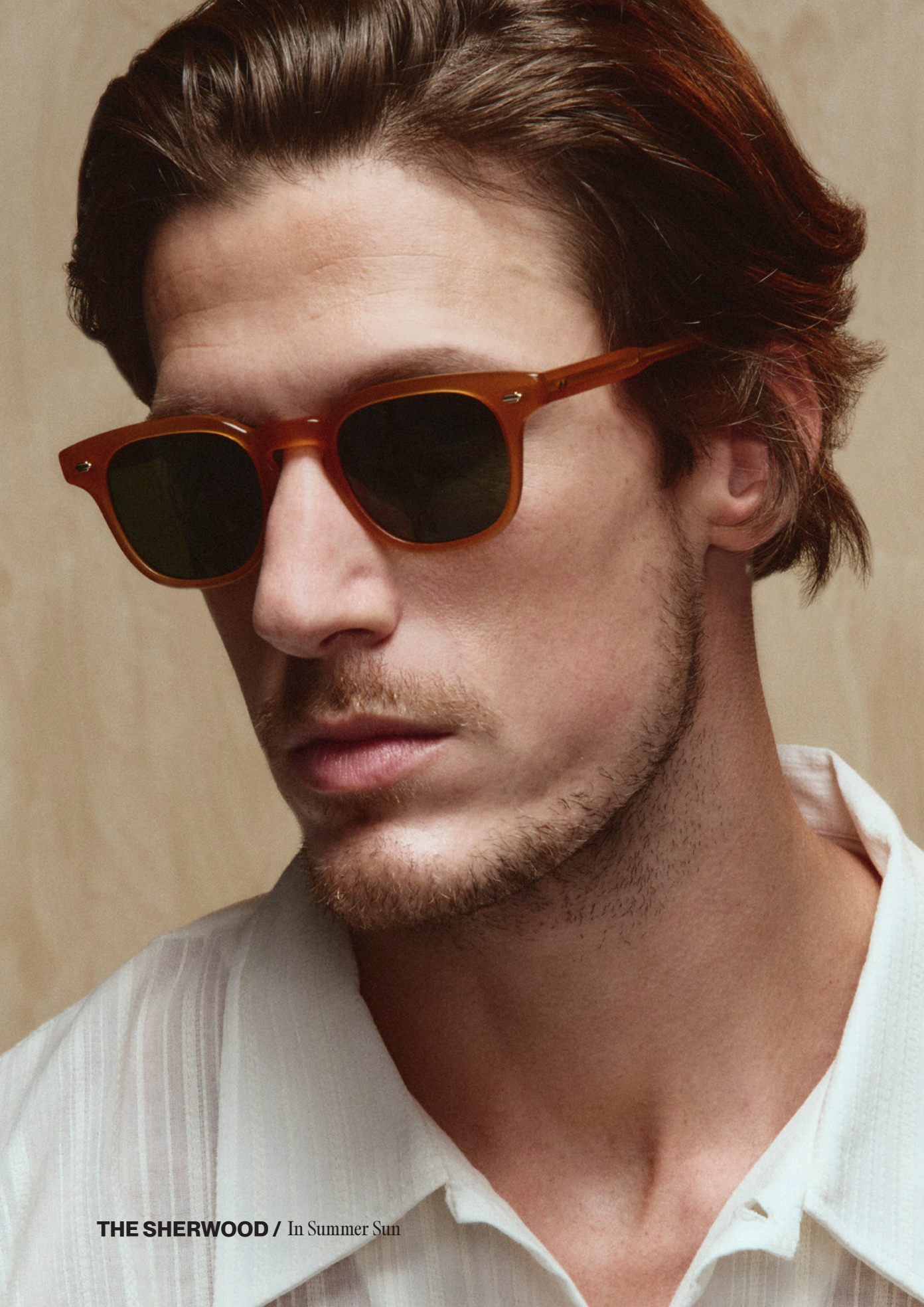
THE SHERWOOD / In Summer Sun