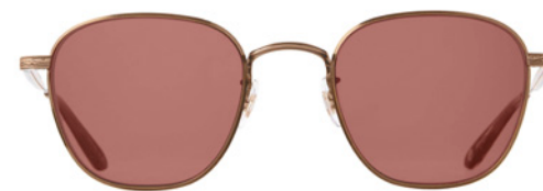
ANTIQUE GOLD-SPOTTED BROWN 4052-49-ATG-SPBRNSH/SFPMGT

The sleek, square-shaped silhouette of the World sunglass belies the utter functionality of its design. With all-metal construction, an intricate coin-edge eyewire pattern, and acetate temple tips, this lightweight frame is crafted for maximum style and comfort.