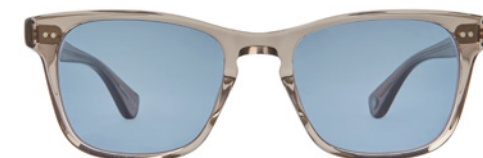
CLAY CRYSTAL 2148-51-CLCR/PAC