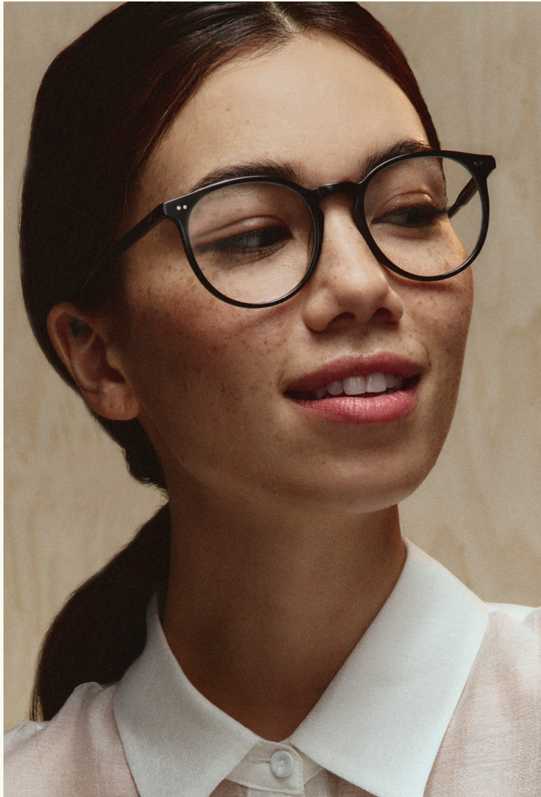
THE MORNINGSIDE / In Black