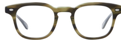
DOUGLAS FIR 1154-44-DGFR / 1154-47-DGFR