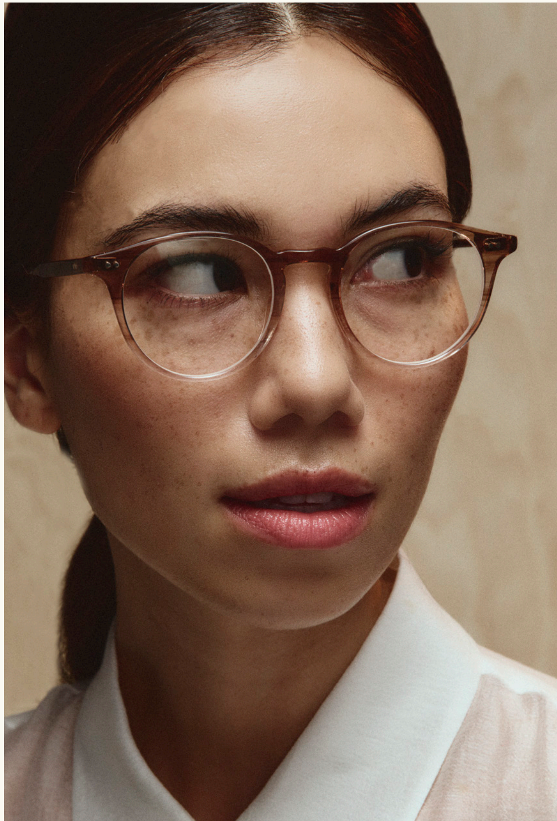
THE CLUNE / In Sandstorm