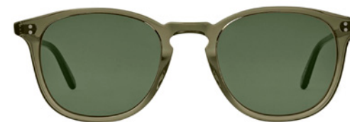
BIO DEEP OLIVE 2007-49-BIO DEOLV/SFPG15

One of our most recognizable and iconic frames, Kinney Sun is an enduring style with balanced proportions suited to fit and flatter both men and women. A defined keyhole bridge lends classic appeal, while soft curves offer wearability to the square-shaped frame.