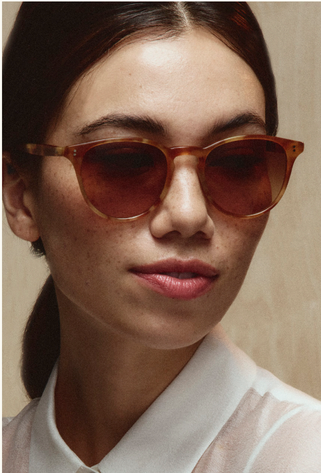
THE MANZANITA / In Ember Tortoise