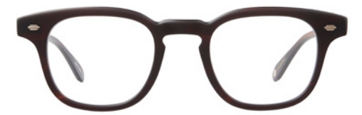
MATTE REDWOOD TORTOISE 1154-44-MRWT / 1154-47-MRWT