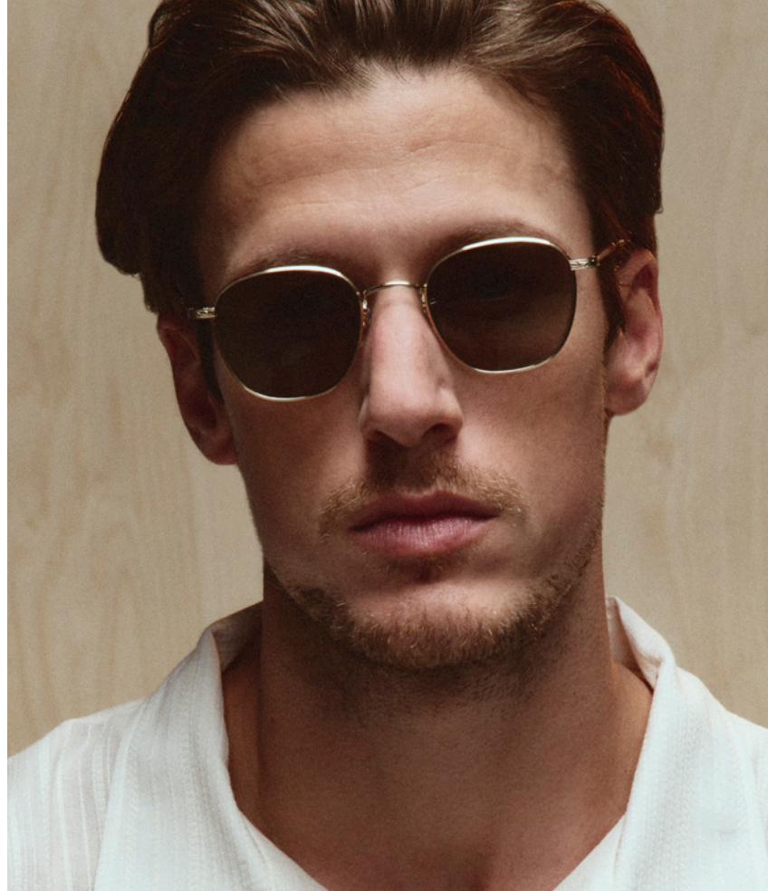
THE WORLD / In Antique Gold-Spotted Brown Shell with Pomagranate