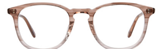
SANDSTORM 1007-47-SASTM / 1007-49-SASTM