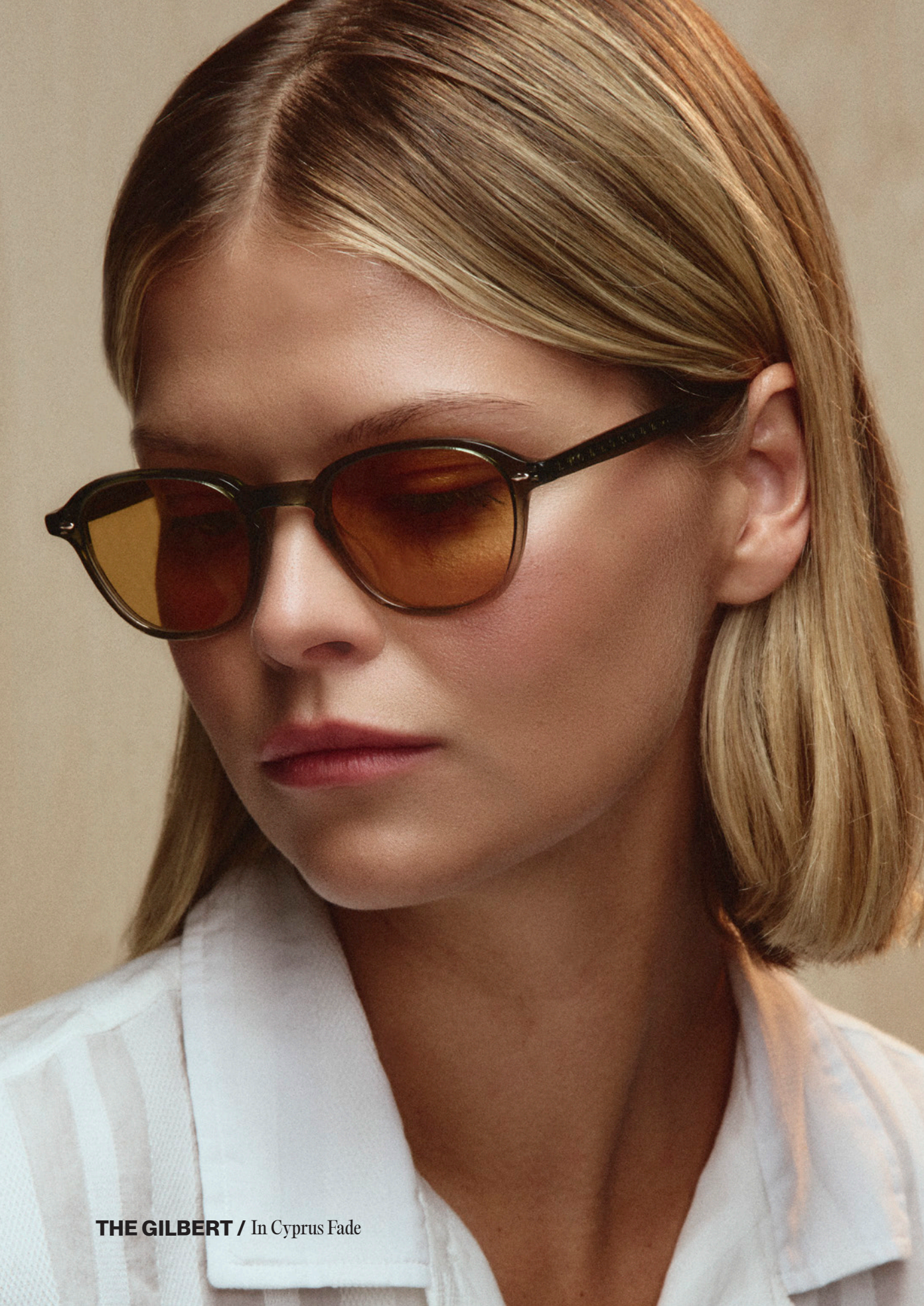
THE GILBERT / In Cyprus Fade