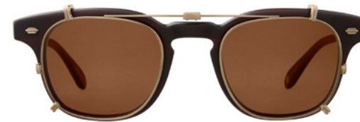
ANTIQUE GOLD 5154-44-ATG/O / 5154-47-ATG/O