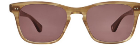
PALISADE TORTOISE 2148-51-PAT/LI