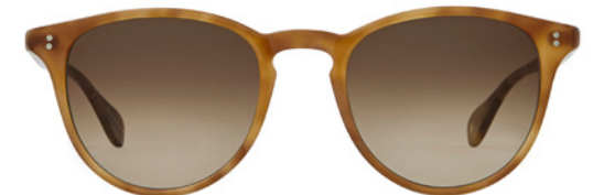
EMBER TORTOISE 2151-50-EMT/CADG