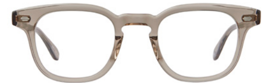
CLAY CRYSTAL 1154-44-CLCR / 1154-47-CLCR