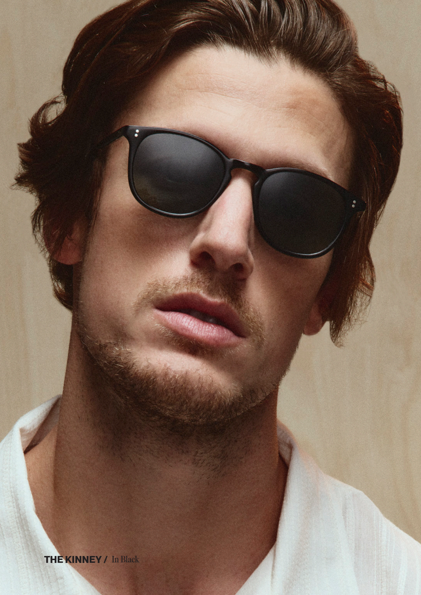
THE KINNEY / In Black