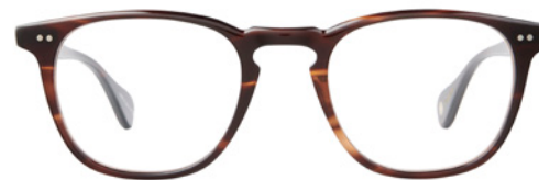
REDWOOD TORTOISE 1153-47-RWT