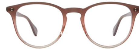
CHERRY FADE 1151-50-CHF

A classic P3 with an uplifted endpiece for a soft, easy wear. Featuring a custom Braid filigree core wire, 5-barrel hinge and a keyhole nose bridge.