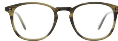
DOUGLAS FIR 1007-47-DGFR / 1007-49-DGFR

One of our forever classics, Kinney boasts a simple yet classic silhouette that's designed to suit everyone. Featuring a semi-square shape with balanced proportions and a keyhole bridge.