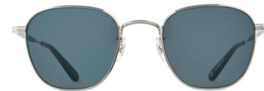
SILVER-SEA GREY 4052-49-S-SGY/SFBS