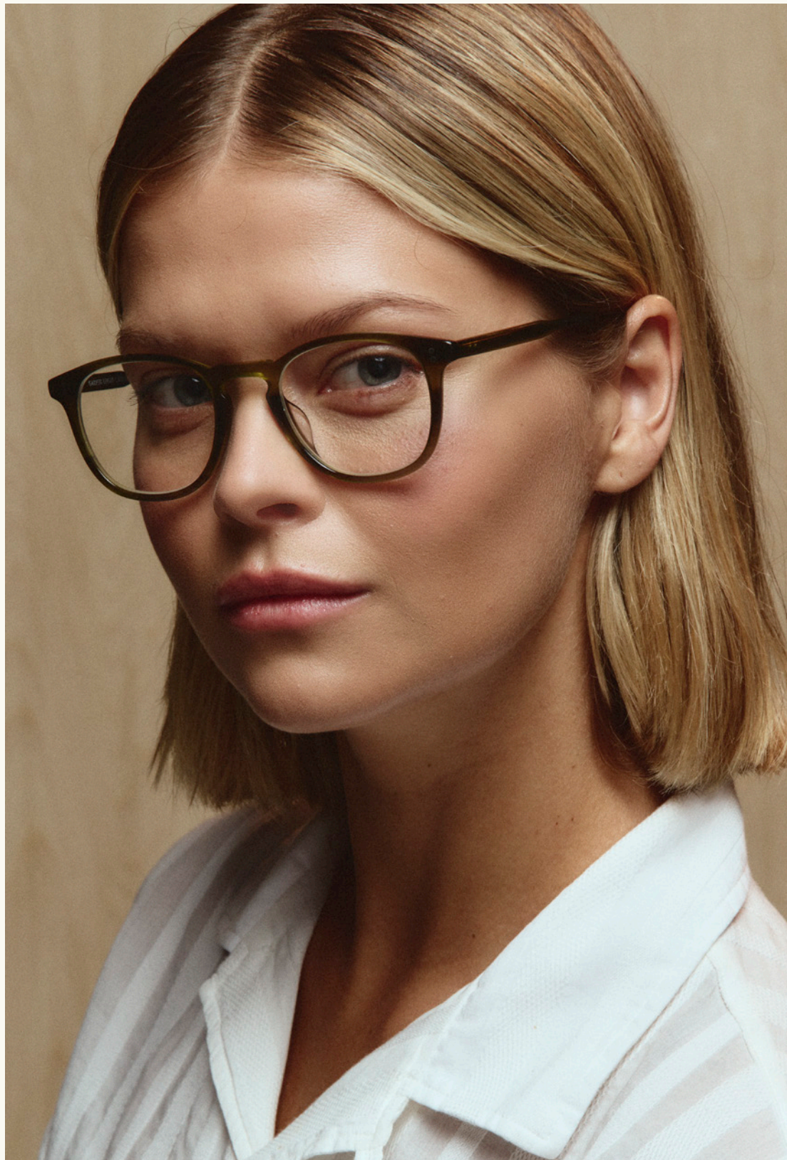
THE KINNEY / In Douglas Fir