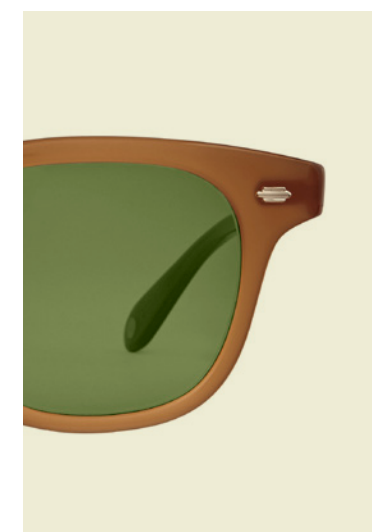
Sun - Summer Sun with Pure Green