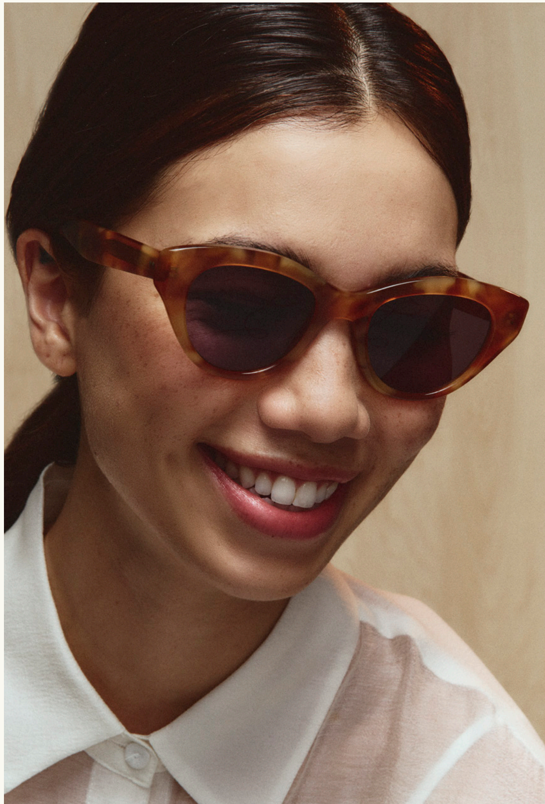
THE DOTTIE / In Ember Tortoise