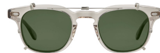
SILVER 5154-44-SV/G15 / 5154-47-SV/G15