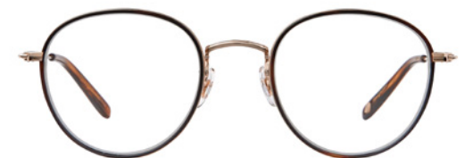
SPOTTED BROWN SHELL-GOLD 3011-48-SPBRNSH-G