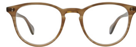
PALISADE TORTOISE 1151-48-PAT