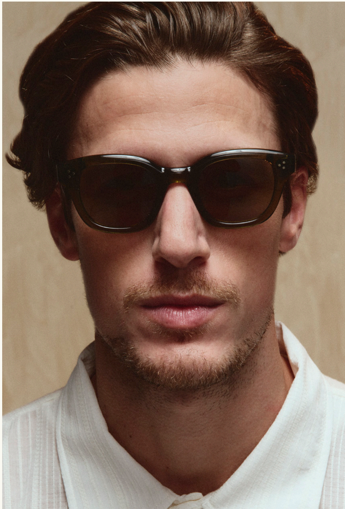
THE CYPRUS / In Willow