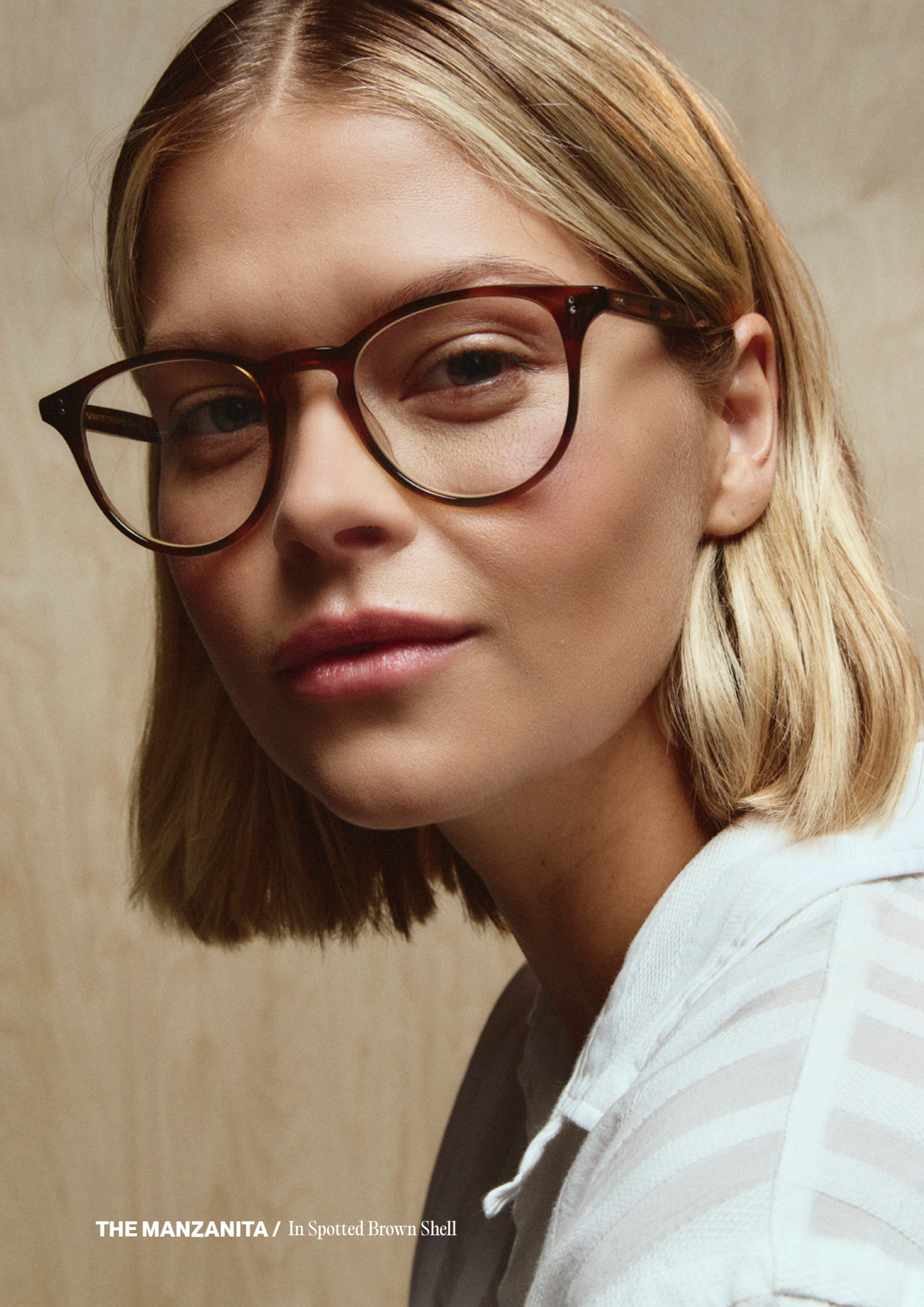
THE MANZANITA / In Spotted Brown Shell