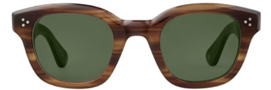
CHERRY WOOD 2152-47-CHW/G15