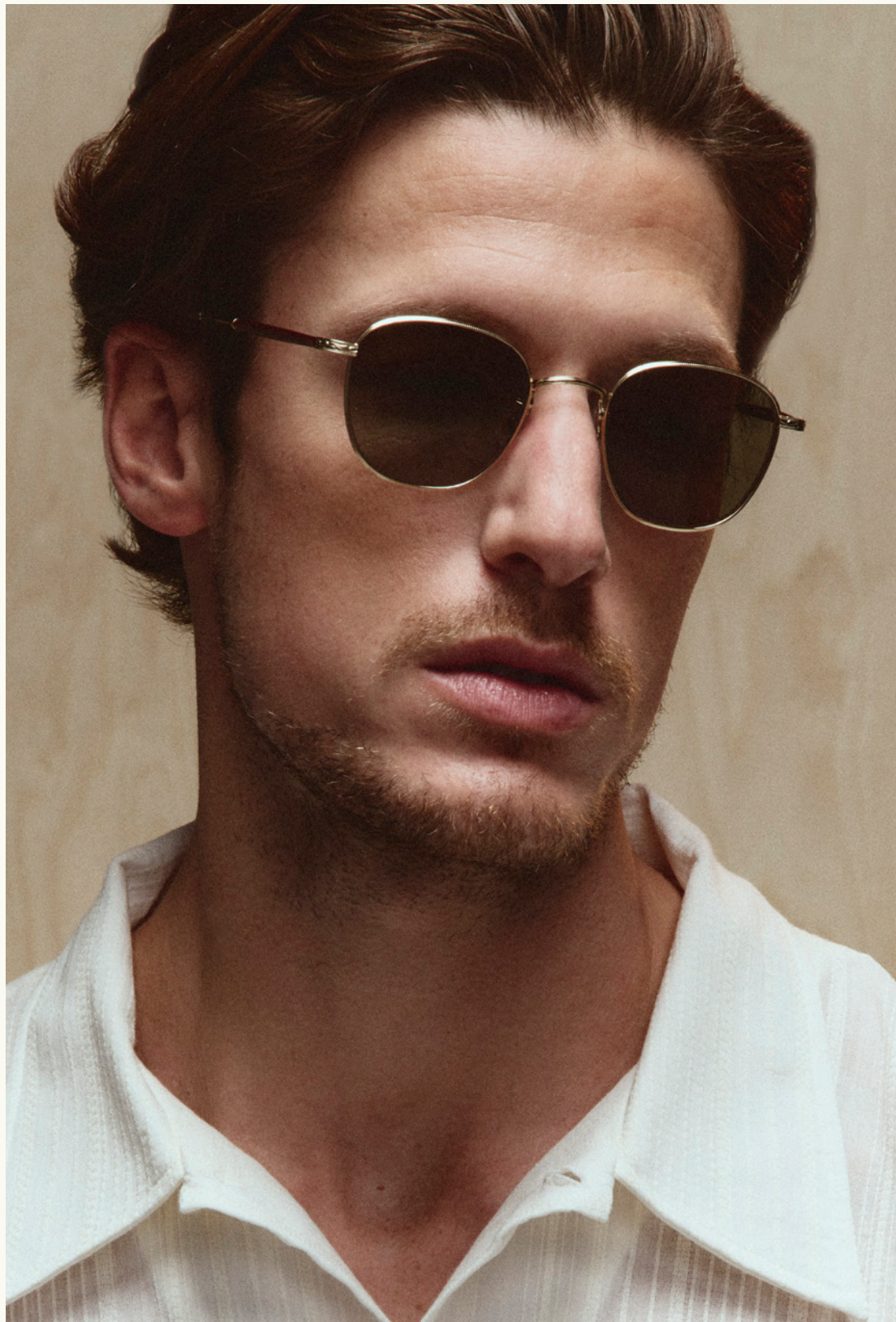
THE WORLD / In Gold-Ember Tortoise