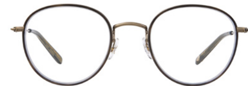
WILLOW-ANTIQUE GOLD-HOPPS 3011-48-HPTO-ATG-WIL