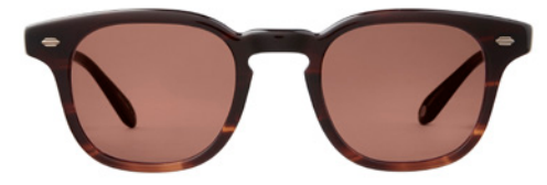
REDWOOD TORTOISE 2154-47-RWT/PRW