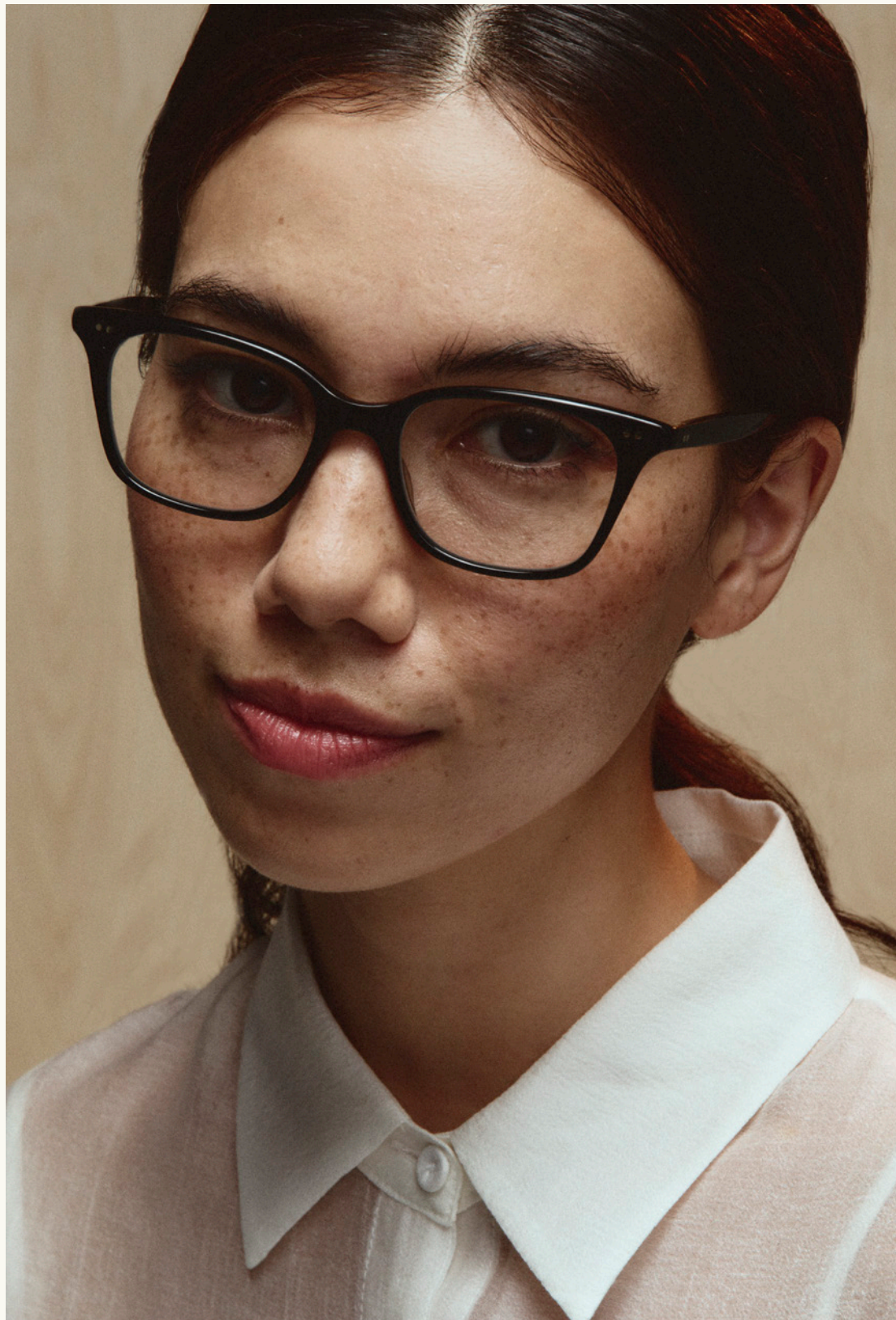
THE MONARCH / In Black