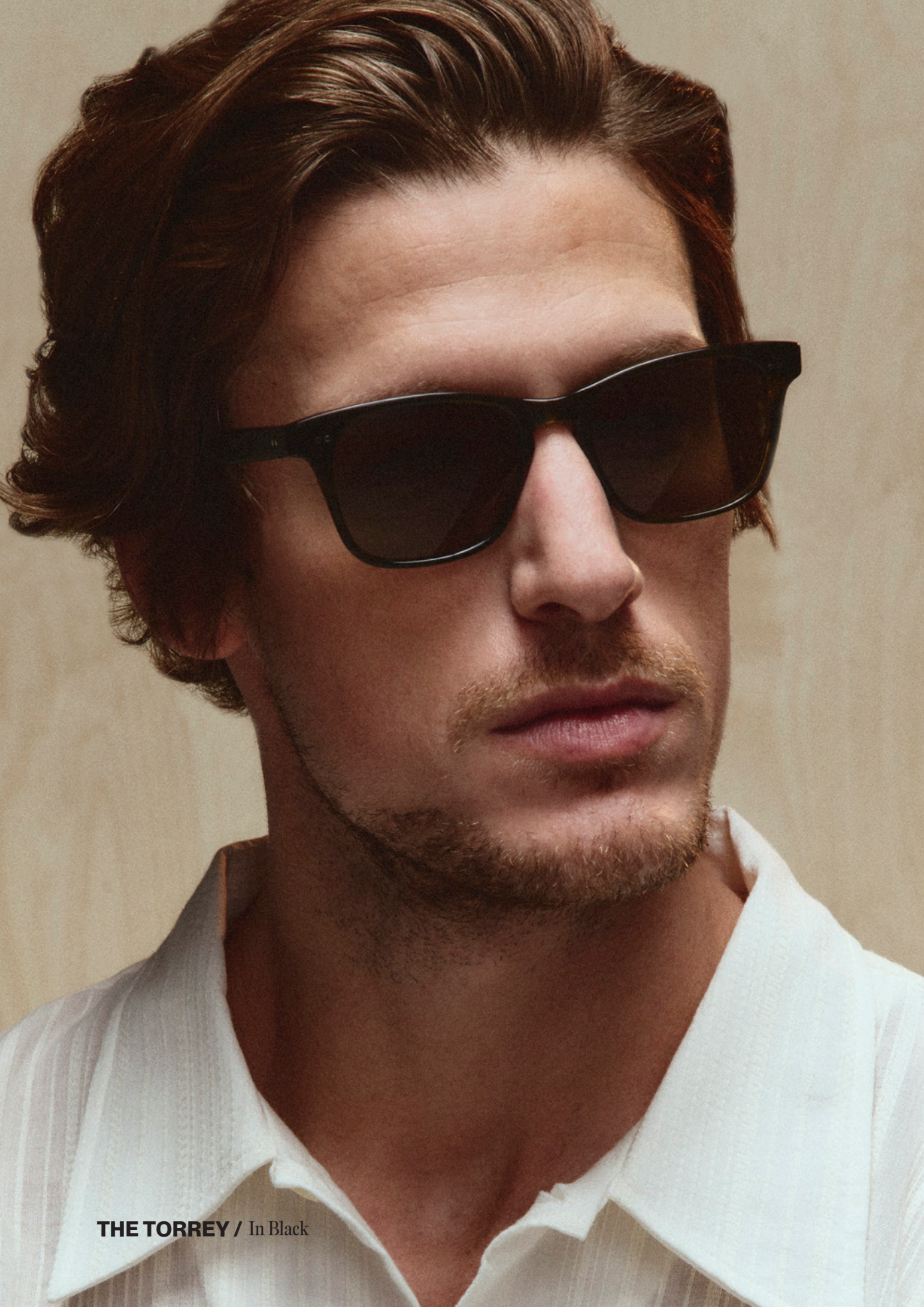
THE TORREY / In Black