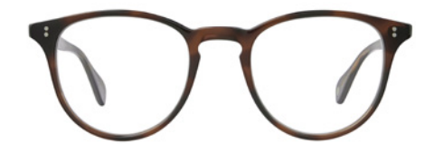
SPOTTED BROWN SHELL 1151-48-SPBRNSH