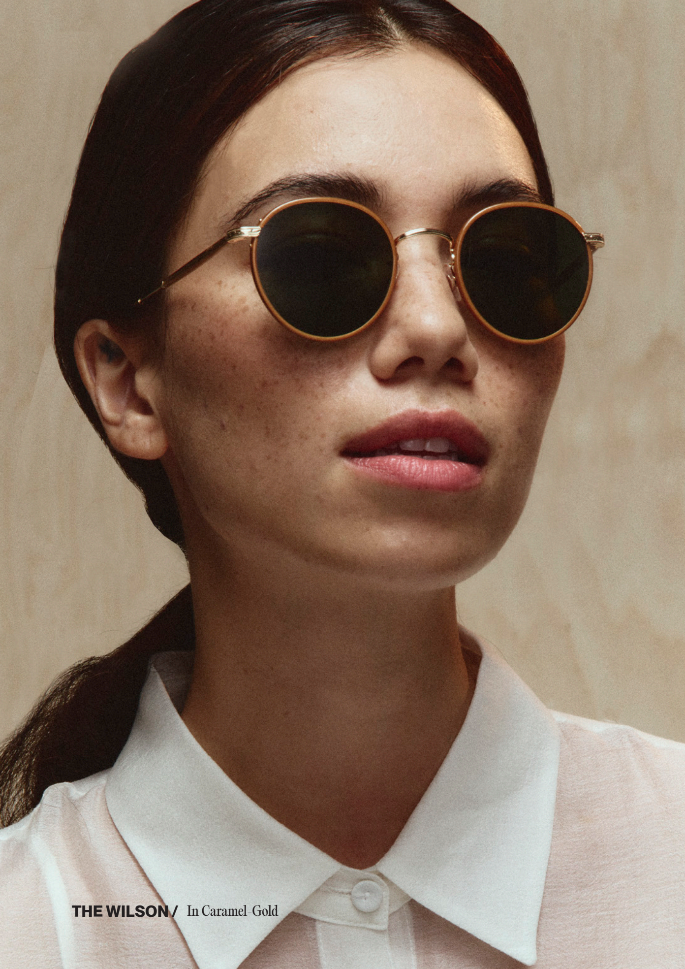
THE WILSON / In Caramel-Gold