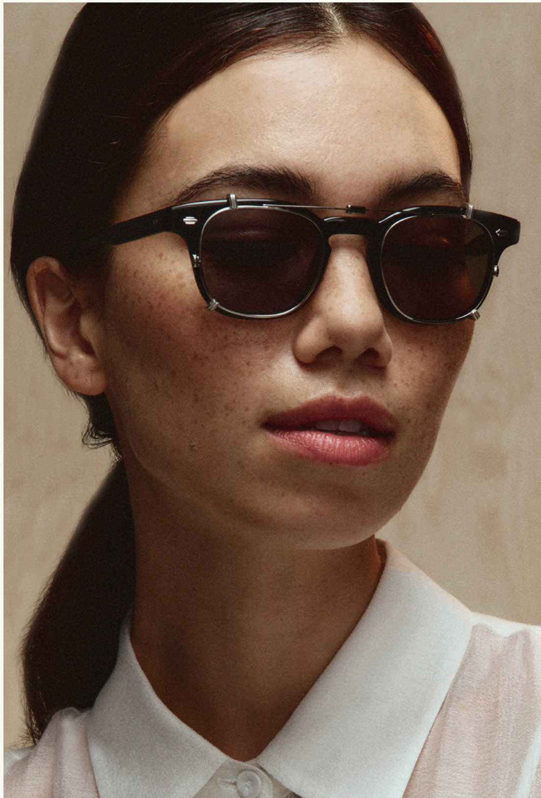
THE SHERWOOD CLIP / In Silver