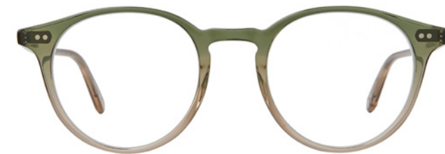
CYPRUS FADE 1047-45-CYPF / 1047-47-CYPF

Inspired by the mid-century, Clune is a modern take on the classic P3 silhouette, with a distinctive round shape and lightweight acetate construction.