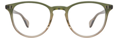
CYPRUS FADE 1151-48-CYPF