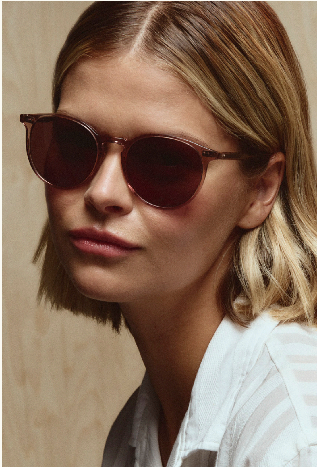
THE MORNINGSIDE / In Desert Rose