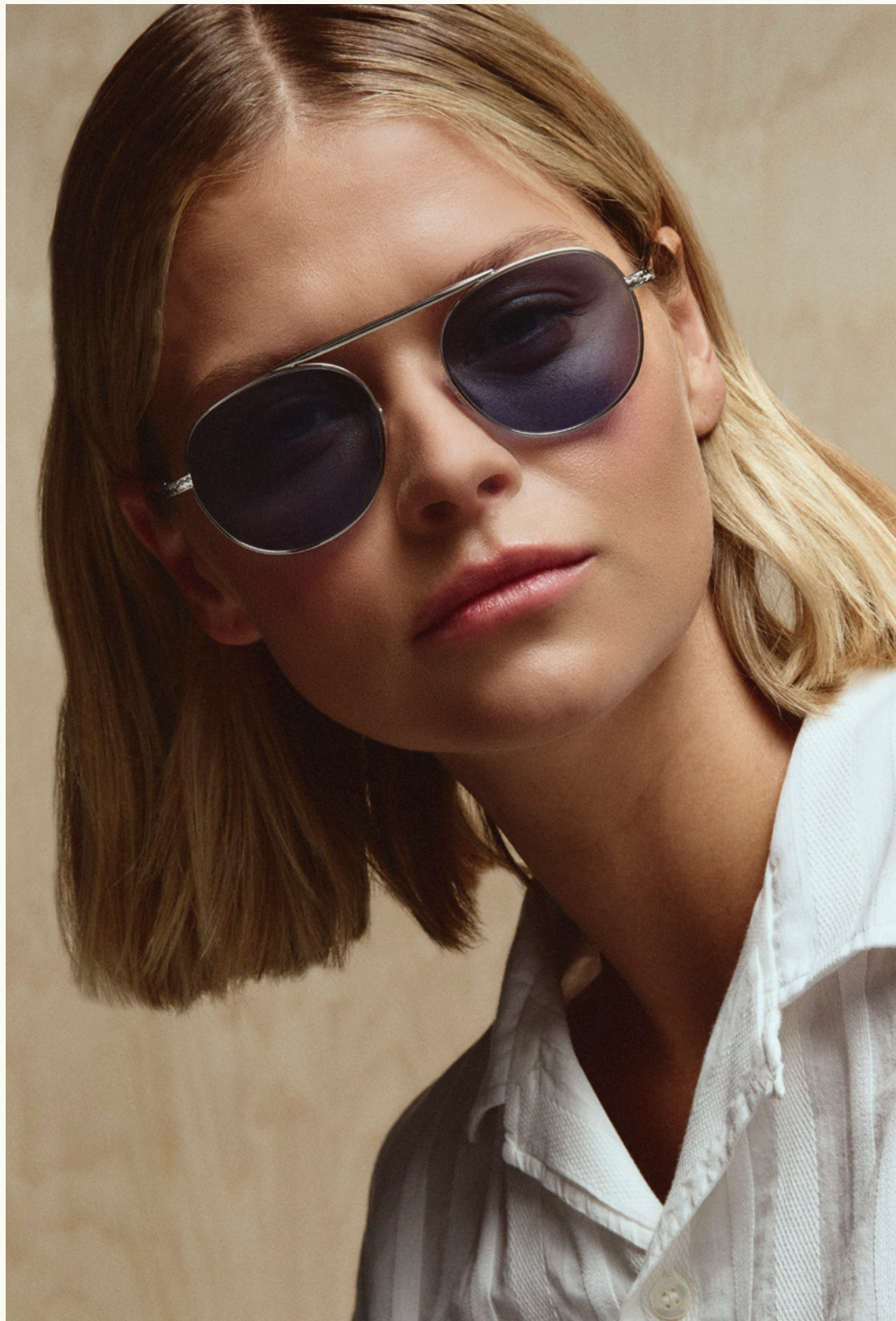
THE VAN BUREN II / In Silver-Sea Grey