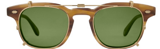
GOLD 5154-44-G/GRN / 5154-47-G/GRN