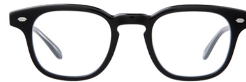
BLACK 1154-44-BK / 1154-47-BK

The Sherwood is a compact, tailored square frame taking design notes from classic 50's eyewear. This frame features a thicker acetate, a custom Braid filigree core wire, and our custom Calabar plaque.