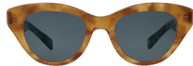
EMBER TORTOISE 2111-49-EMT/SFBS

The Dottie is an updated cat eye taking inspiration from LA's new wave pop-punk scene. Designed with a thick acetate, larger fit, and offered in new, ultra-glam colorways, the Dottie is all about attitude.