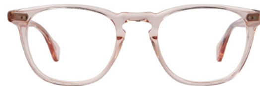
HIMALAYAN SALT 1153-47-HIMSLT

The Wilshire is a sophisticated, soft square frame composed of a thin and light weight Cured Cellulose Acetate. Featuring a custom Braid filigree core wire, 5-barrel hinge and a keyhole nose bridge. If you're fan of our classic Kinney this is a nice addition to your eyewear collection.