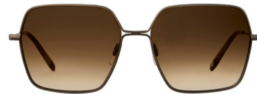
ANTIQUE GOLD-VINTAGE BURNT TORTOISE 4067-56-ATG-VINBRT/BRNTG

The Meadow Sun is an oversized, 70's inspired frame for a glamorous look. Featuring a stainless steel frame with cured cellulose acetate temple tips and BPA-free adjustable nose pads. 100% UV Protection.