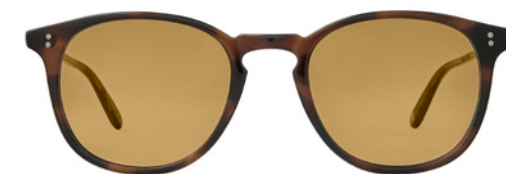
SPOTTED BROWN SHELL 2007-49-SPBRNSH/SFPMP