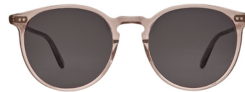
DESERT ROSE 2076-51-DER/SFBKLIQ

The Morningside Sun is a new oversized sunglass style inspired by Lauren Hutton's iconic look in American Gigolo . The ultra-chic rounded frames come in colorful pastel and classic colorways paired with semi-flat colored lenses.