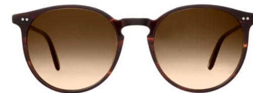
REDWOOD TORTOISE 2076-51-RWT/SFBRNTG