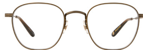
ANTIQUE GOLD-REDWOOD TORTOISE 3009-49-ATG-RWT

An updated version of our previous bestseller, the Grant features a thin, enamel-painted, all-metal eyewire for enhanced comfort, performance, and fit. Simple filigree details add subtle interest to this minimal, square frame.