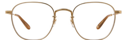
GOLD-SIERRA TORTOISE 3009-49-G-SRAT