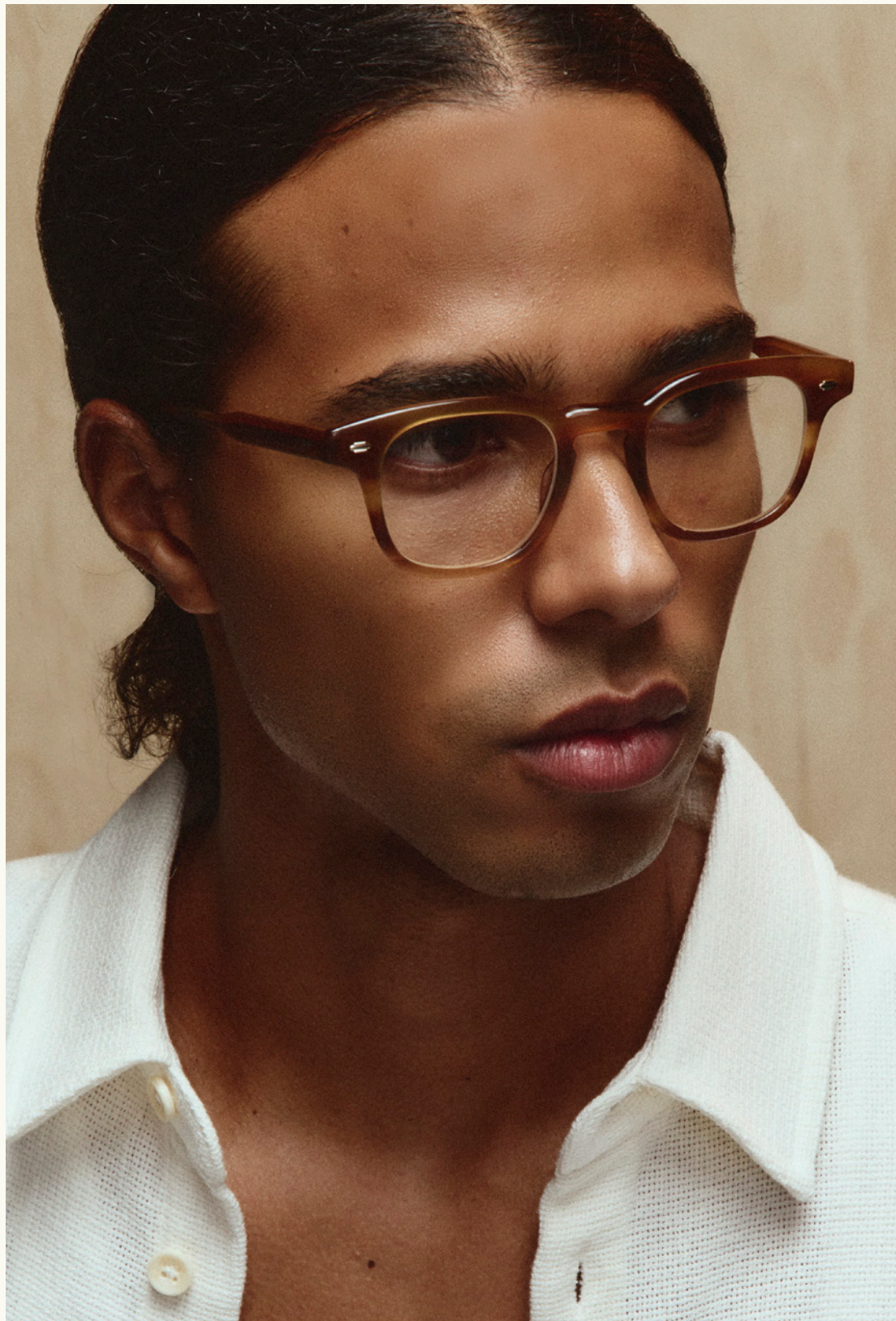
THE SHERWOOD / In True Demi