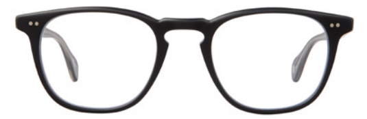
MATTE BLACK 1153-47-MBK