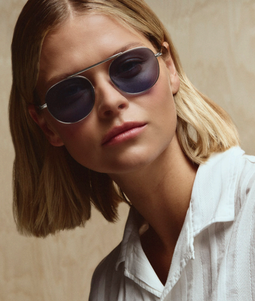
THE VAN BURREN II / In Silver Sea Grey with Pure Blue Smoke