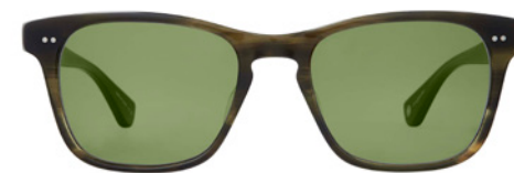
DOUGLAS FIR 2148-51-DGFR/GRN