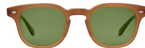
SUMMER SUN 2154-47-SUS/PGN