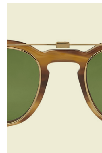
Clip - Gold with Green