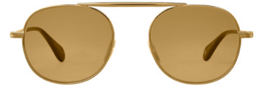
GOLD-DOUGLAS FIR 4066-49-G-DGFR/FPMP