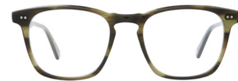
DOUGLAS FIR 1150-50-DGFR