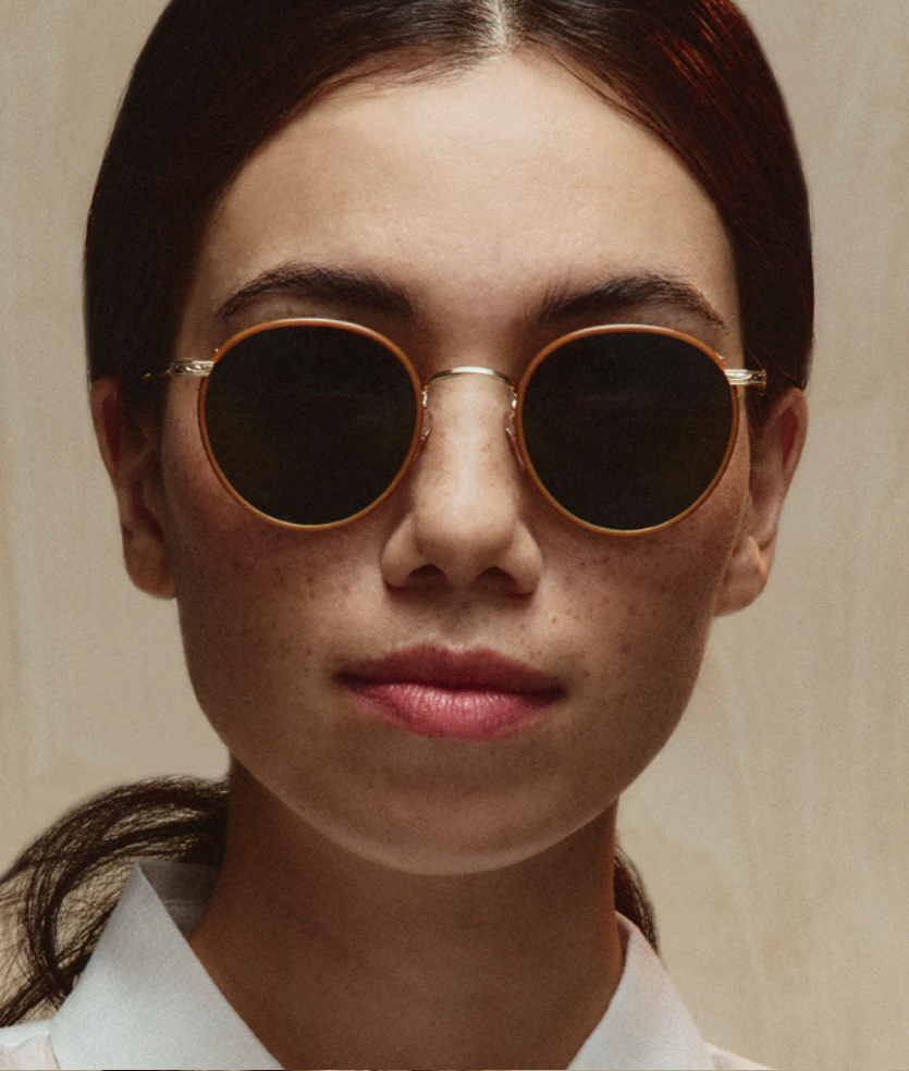
THE WILSON / In Antique Gold-Spotted Brown Shell with Pomagranate