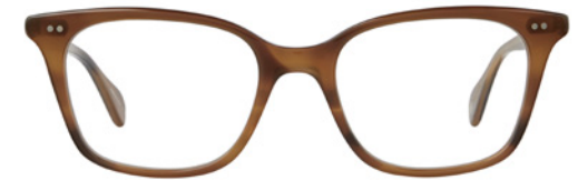
CEDAR TORTOISE 1155-49-CEDT