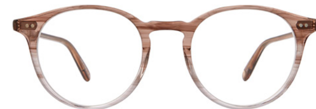
SANDSTORM 1047-45-SASTM / 1047-45-SASTM