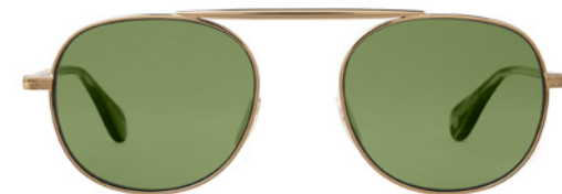
GOLD-SAP TORTOISE 4066-49-G-SAPT/FPGN