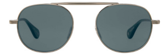
SILVER-SEA GREY 4066-49-SV-SGY/FPBS