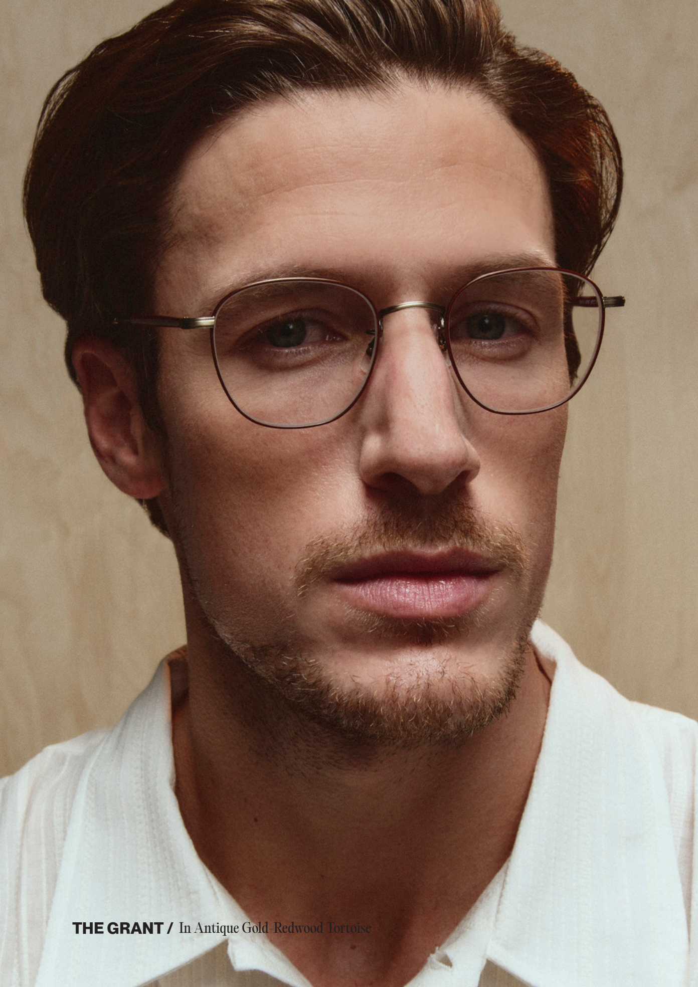
THE GRANT / In Antique Gold-Redwood Tortoise