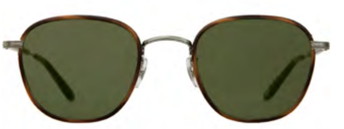
Demi Blonde-Brushed Silver-True Demi/Semi-Flat Pure Green 4009-48-DB-BS-TD/SFPGN