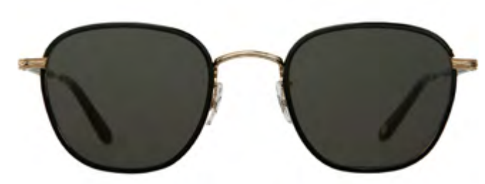
Black-Gold-Black/Semi-Flat Pure Grey 4009-48-BK-G-BK/SFPGY

For this new iteration of one of our best selling Windsor-style frames we adjusted the Grant's size and improved its construction. New details include rivets to secure the windsor rim and a more shallow silhouette for an improved it.