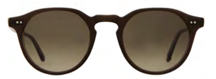
Break On Through/Semi-Flat Pure Olive Gradient 2100-47-BOT/SFPOG

Unisex, timeless, and lighweight, the Royce is destined to be your next favorite P3-inspired frame. Equal parts angular and rounded, its distinctive construction and mineral glass lenses are as eye-catching as they are versatile.