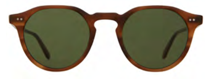
Saddle Tortoise/Semi-Flat Pure Green 2100-47-SDT/SFPGN