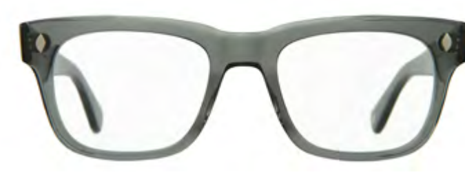
Sea Grey 1097-49-SGY