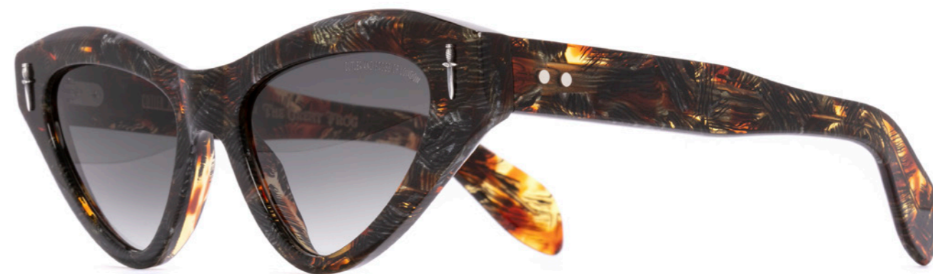
GFSN-009-52-02 Brush Stroke