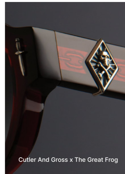
Cutler And Gross x The Great Frog