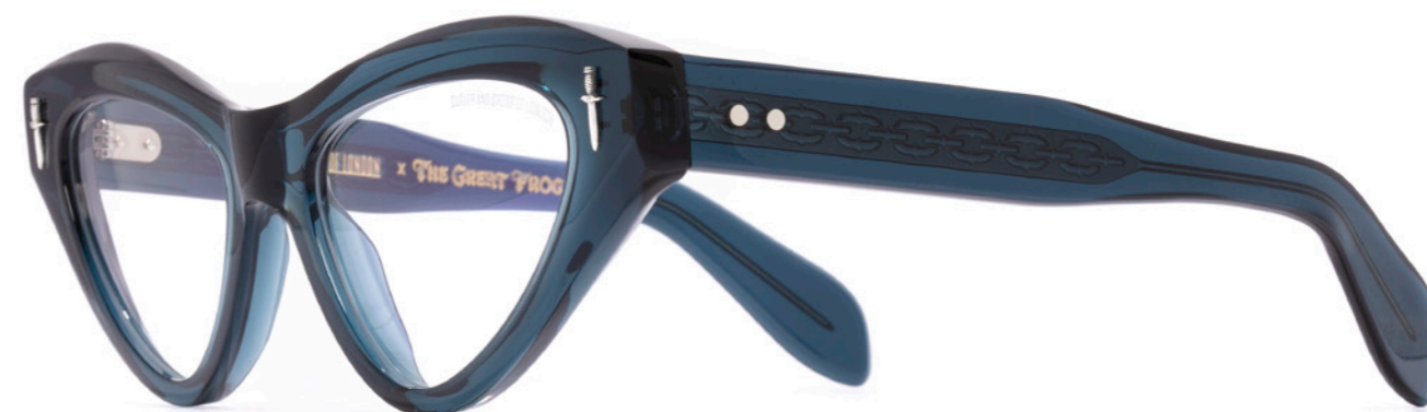
GFOP-009-52-03 Deep Teal