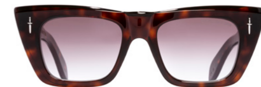
GFSN-008-51-02 Black Turtle