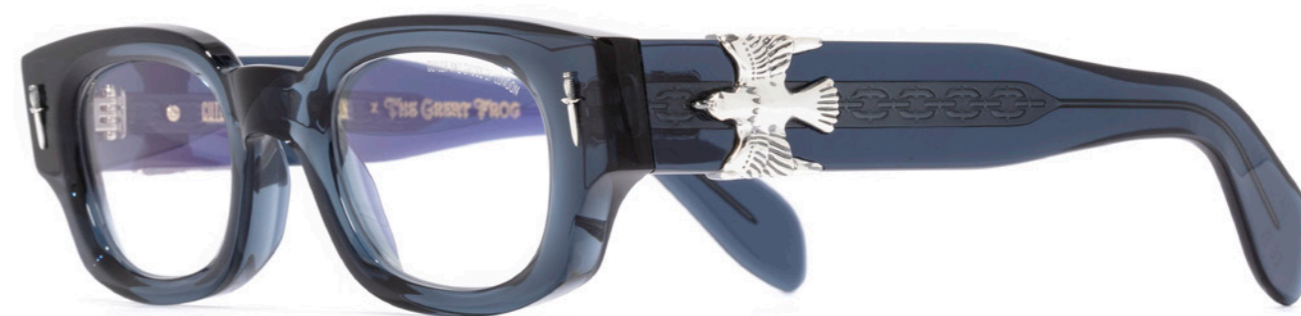
GFOP-004-48-03 Deep Blue