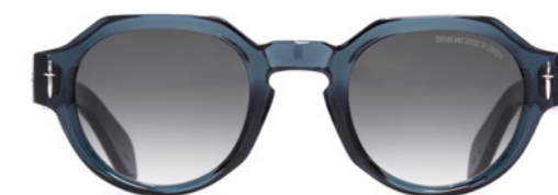
GFSN-006-48-04 Deep Blue