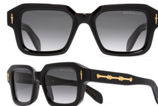
GFLE-005-52-01 Black Gold

These square sunglasses are gilded with The Great Frog's anarchic iconography in 24K Gold: three bones disrupt the sidearm while a dagger slices through the frontal. The limited edition design is set with gradient lens and threaded with 24K Gold-plated Lock Down chain core wire.