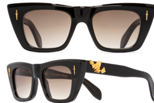
GFLE-008-51-01 Black Gold

24K Gold details accent these limited edition cat-eye sunglasses, created in collaboration with The Great Frog. The Black frames are disrupted by a Gold, skeletal hand that wraps around the temple, clutching a rose. Two daggers mark the front of the gender-bending silhouette, which features a straight brow line and Plectrum tips.