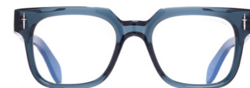
GFOP-007-52-03 Deep Blue