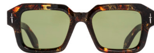
GFSN-005-52-02 Brush Stroke