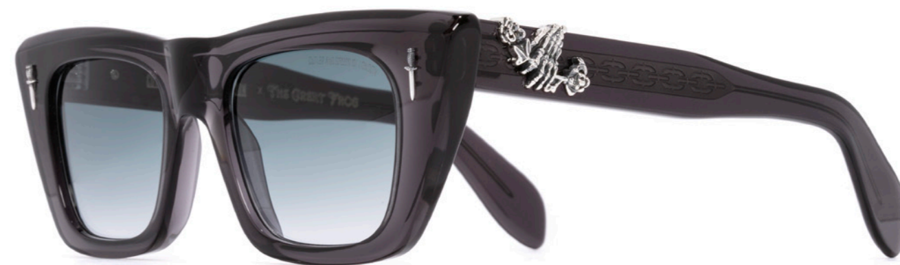
GFSN-008-51-03 Dark Grey