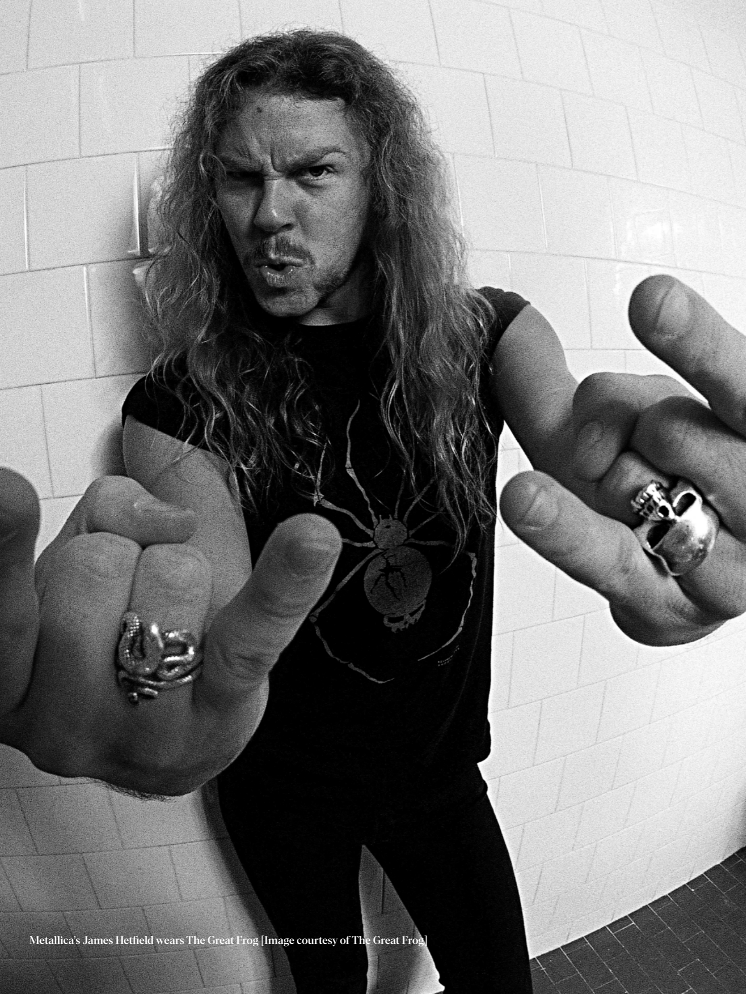
Metallica's James Hetfield wears The Great Frog