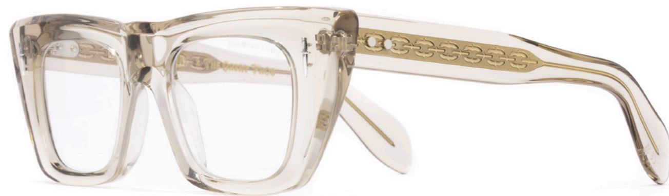
GFOP-008-49-04 Sand Crystal