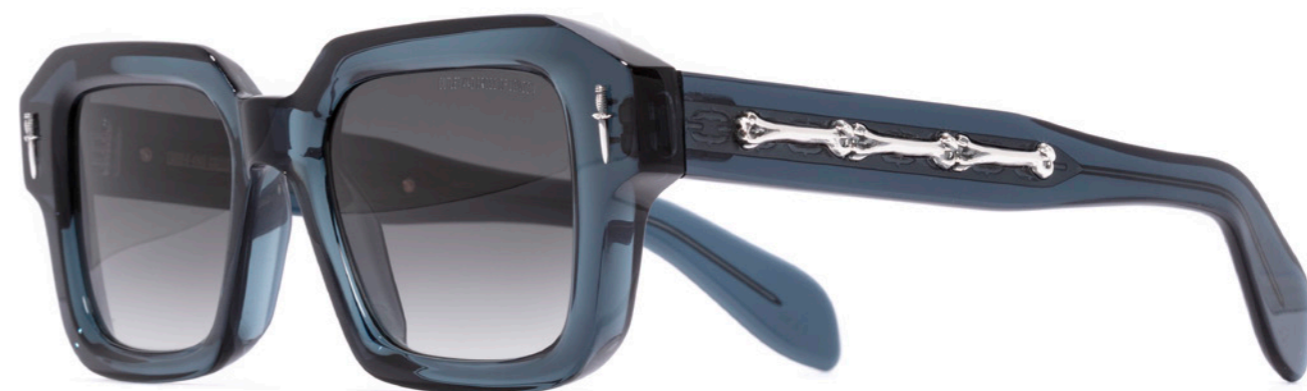
GFSN-005-52-03 Deep Blue