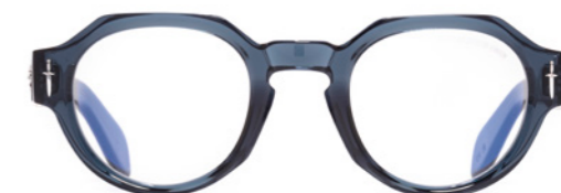
GPOP-006-48-03 Deep Blue