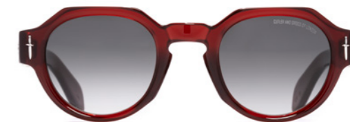
GFSN-006-48-03 Red Jed