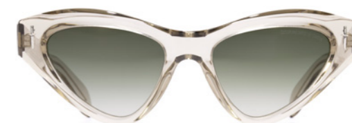
GFSN-009-52-04 Sand Crystal