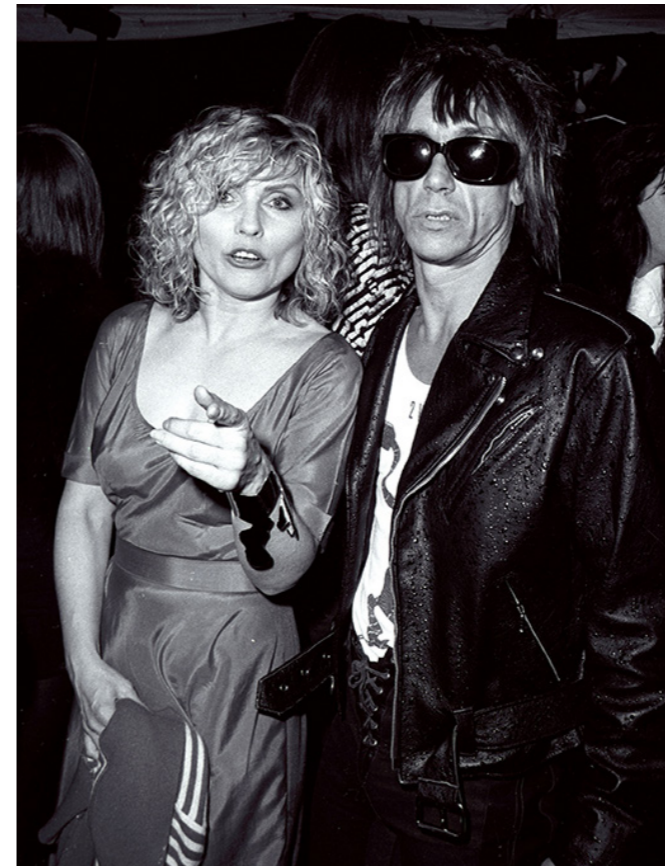
Iggy Pop wears Cutler and Gross, alongside Blondie