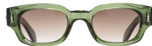
GFSN-004-50-03 Leaf Green