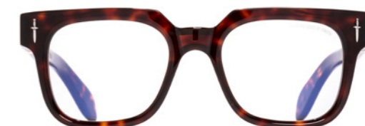
GFOP-007-52-02 Dark Turtle