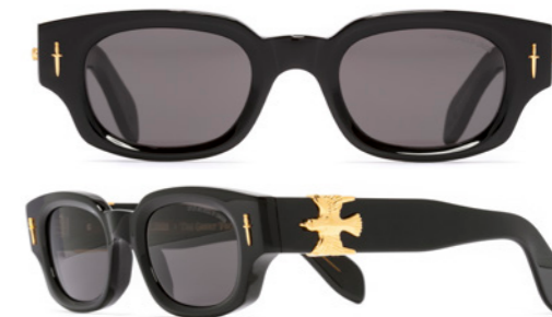
GFLE-004-50-01 Black Gold

Gilded in 24K Gold, an eagle soars across the side of this sunglass. They're crafted by hand to a square silhouette that echoes old-school biker frames. Reflecting The Great Frog's rebellious mood, 24K Gold-plated Dagger pins punctuate the frontal, while custom Lock Down chain core wire threads through the temples.