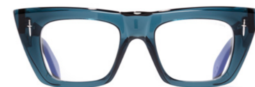
GFOP-008-49-03 Deep Teal