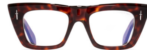
GFOP-008-49-02 Dark Turtle