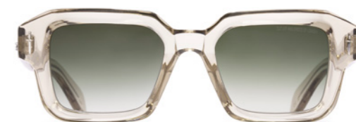
GFSN-005-52-04 Sand Crystal